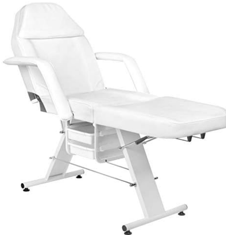
Figure 2: The chair adjusted to an upright position, ideal for various cosmetic procedures.

The backrest and legrest sections of the chair are manually adjustable. Locate the adjustment levers or knobs, typically found on the sides or underneath the chair sections. Lift or lower the sections to the desired angle and secure them in place using the locking mechanism.