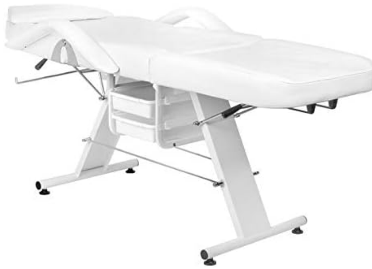
Figure 3: The chair fully flattened, suitable for massage or full-body treatments.