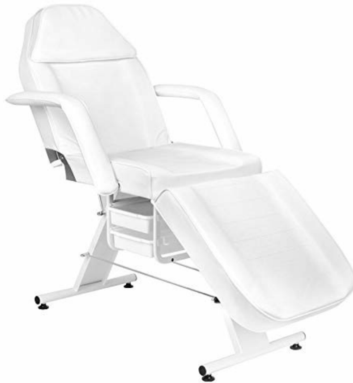
Figure 1: The Activeshop Basic 202 Cosmetic Treatment Chair in a reclined position, highlighting its adjustable features and integrated storage.