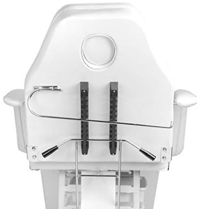
Figure 4: Rear view of the chair, illustrating the disposable cover bracket and backrest adjustment points.

The bracket located on the backrest is designed to hold rolls of disposable covers, napkins, or towels, ensuring hygiene and easy access during procedures.