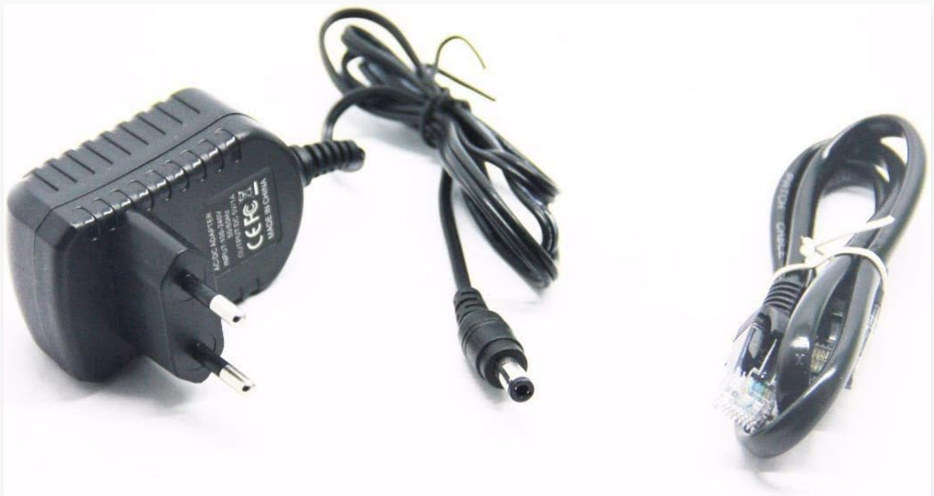
Image 3.2: The essential accessories included with the router: the power adapter for electrical connection and an Ethernet cable for wired network setup.