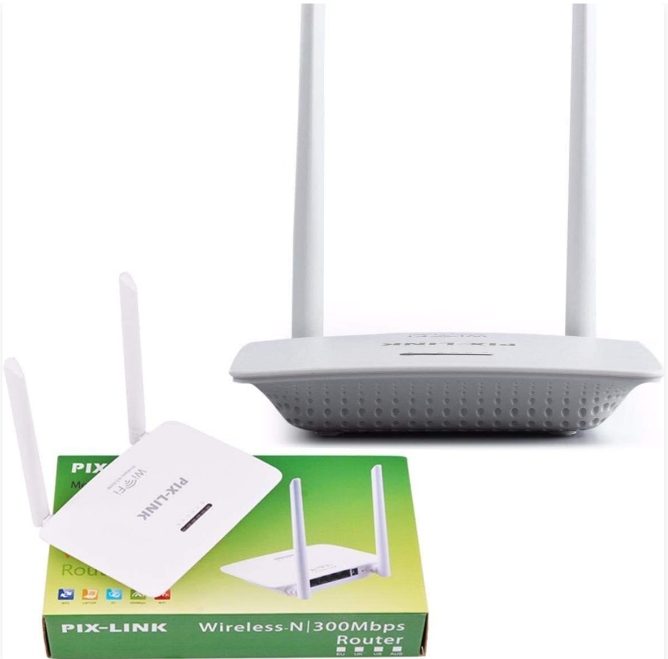
Image 1.1: The PIX-LINK LV-WR07 Wireless Router, showcasing its compact design and two external antennas.