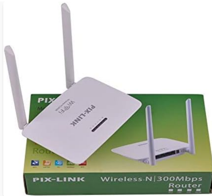
Image 3.1: The PIX-LINK LV-WR07 Wireless Router shown with its retail packaging, indicating the product as it appears in the box.