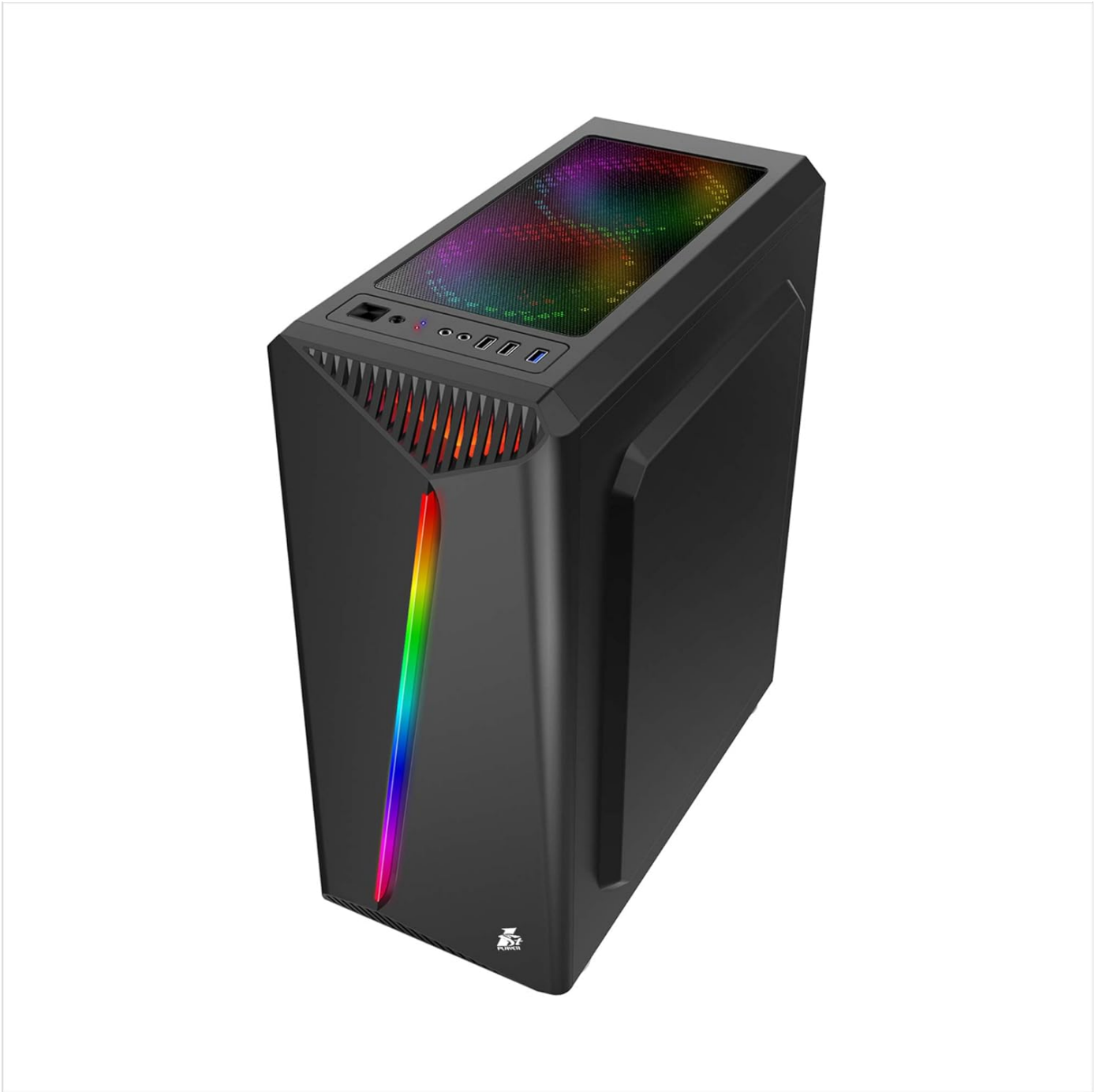
Image: Top-front view of the Rainbow R3 case, illustrating the I/O panel where the RGB control button is located.

software (if applicable). Refer to your motherboard manual for software control options.