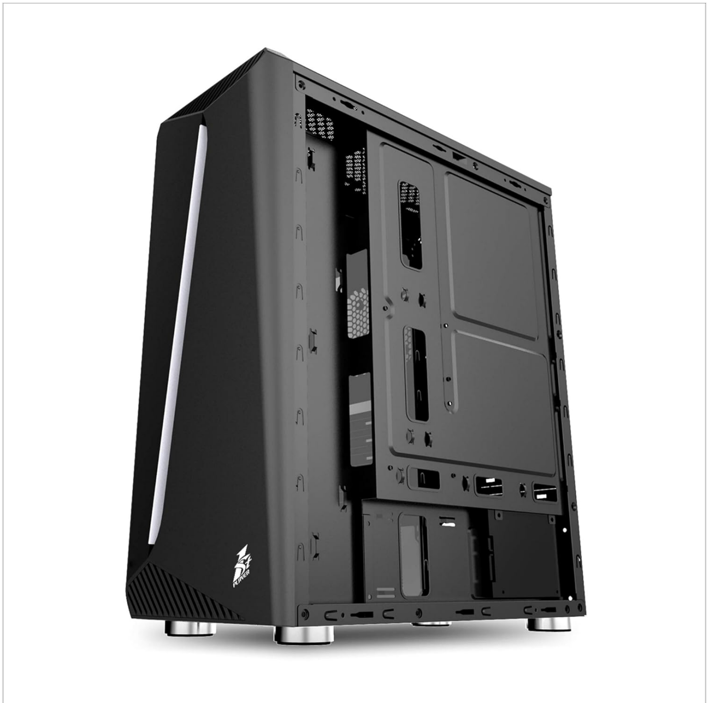
Image: Interior view of the Rainbow R3 case, showing the internal layout for component installation.