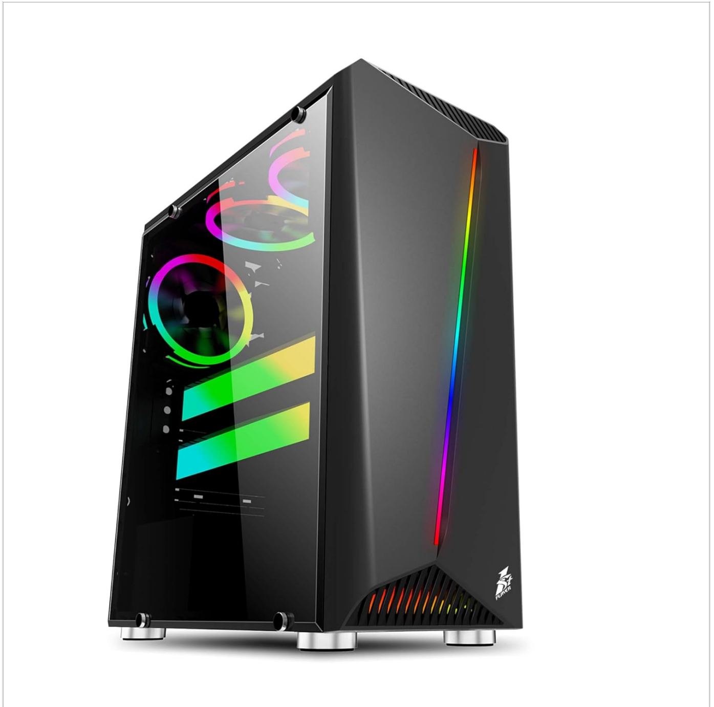
Image: Front view of the assembled Rainbow R3 case, showcasing its design and RGB lighting.