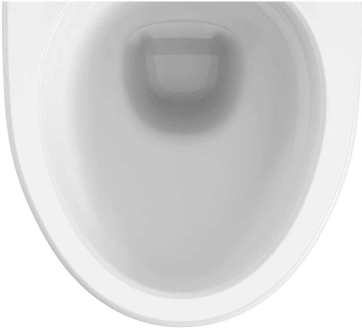
Image: Top-down view of the CERSANIT toilet bowl, highlighting the CleanOn rimless design for easy cleaning.