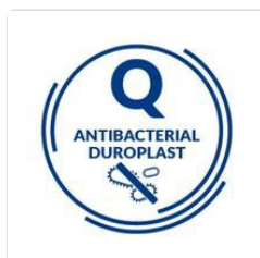
Image: Icon indicating the antibacterial properties of the Duroplast toilet seat material.