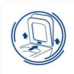
Image: Icon depicting the soft-close function of the toilet seat, showing gentle lowering.

The Duroplast toilet seat features a soft-close mechanism for quiet and gentle closing. Simply push the seat or lid downwards slightly, and it will lower slowly and silently on its own.