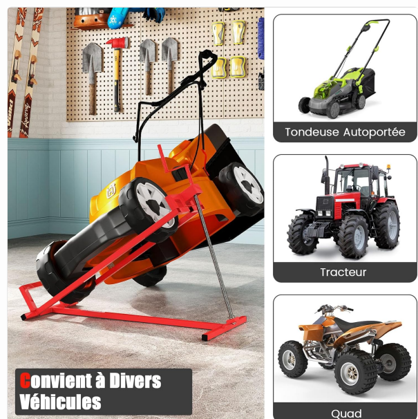
Figure 3.4: The versatility of the jack, suitable for lifting various vehicles including self-propelled mowers, garden tractors, and quad bikes.