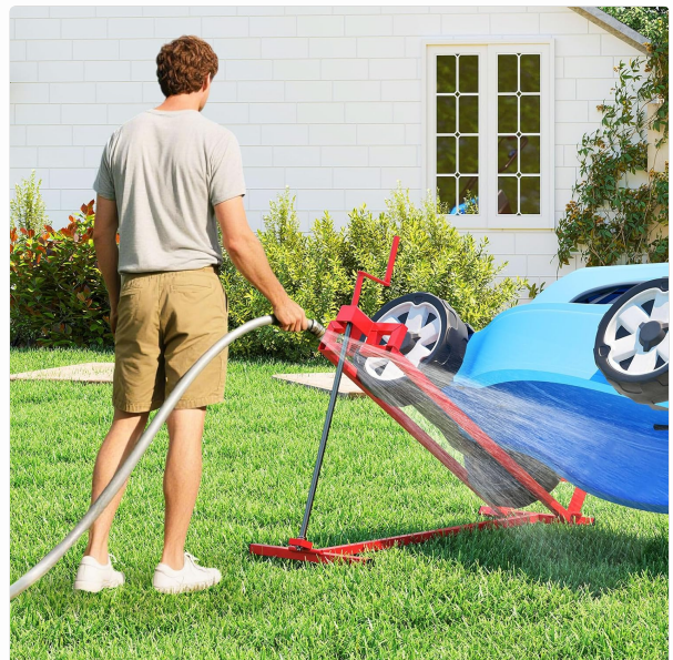
Figure 5.2: A user cleaning the underside of a lawn mower, illustrating the convenient access provided by the elevated jack.