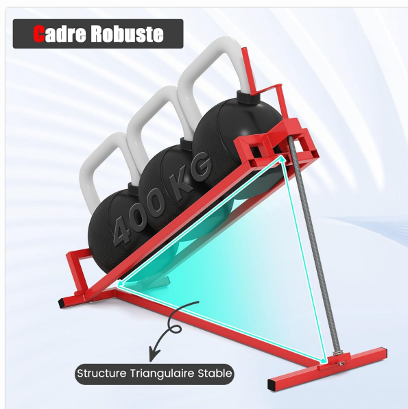
Figure 3.3: The robust frame and stable triangular structure of the jack, demonstrating its capability to support up to 400 kg.