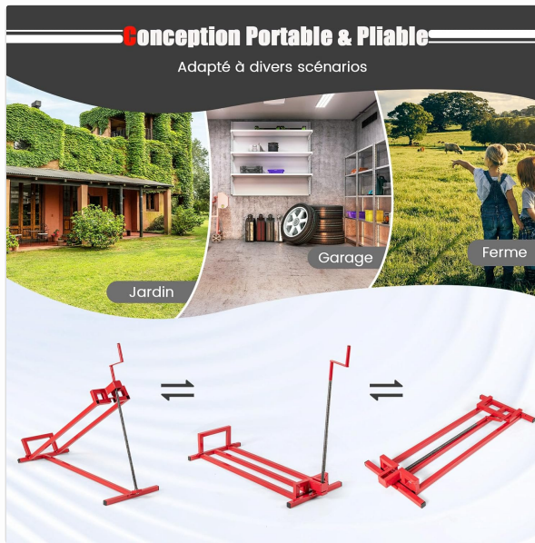
Figure 6.1: The jack's portable and foldable design, making it suitable for use in various scenarios like gardens, garages, or farms, and easy to store compactly.