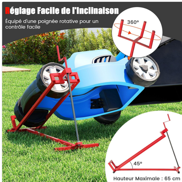
Figure 5.1: Demonstrating the easy tilt adjustment feature, highlighting the 360-degree rotating handle for precise control and a maximum operational height of 65 cm.