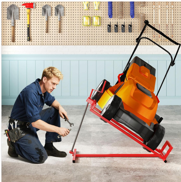
Figure 3.1: A man performing maintenance on a lawn mower securely positioned on the COSTWAY jack.