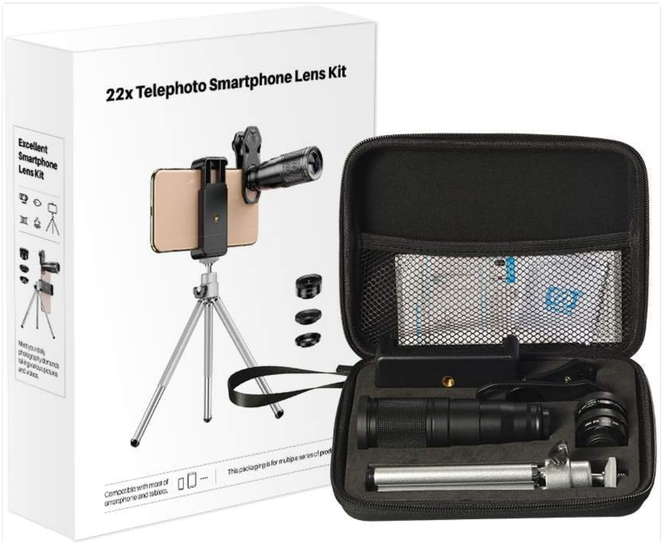
Figure 2: Kit Contents and Packaging