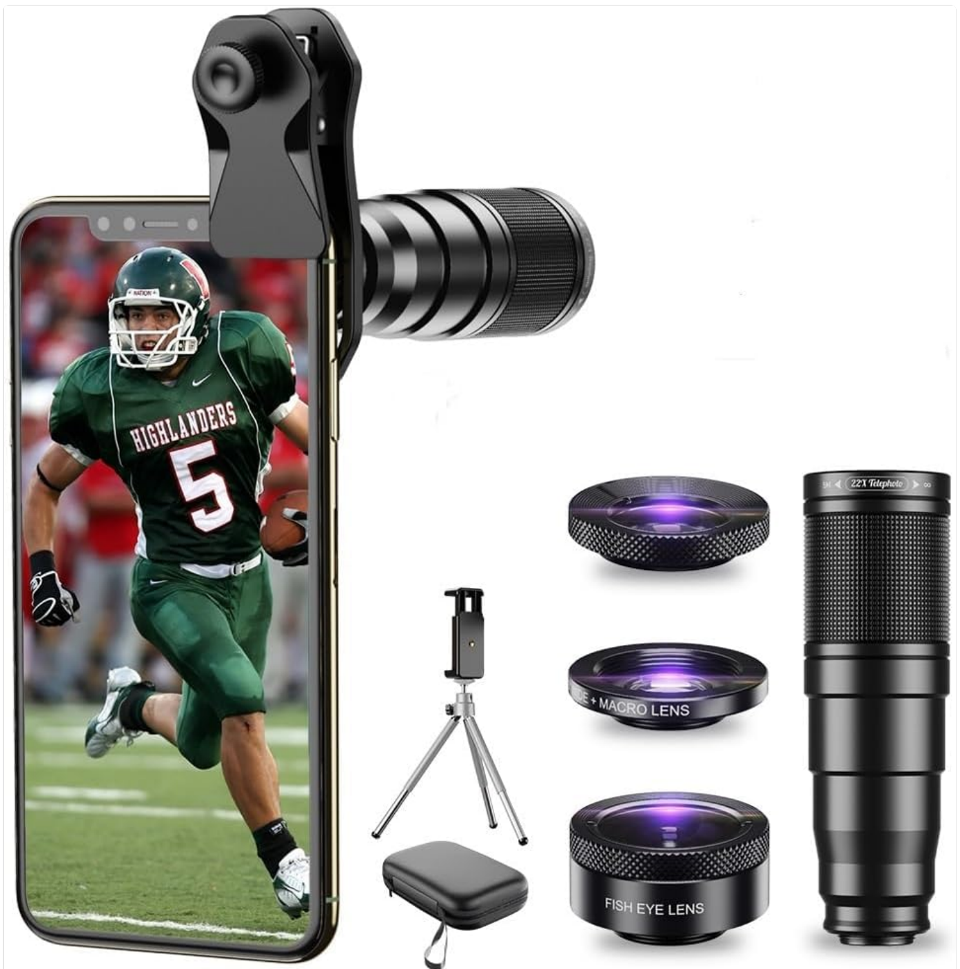
Figure 1: Apixel Phone Lens Kit APL-22XB105 Overview