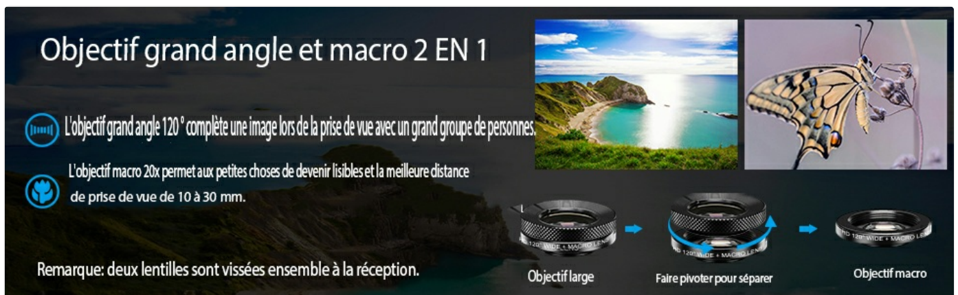
Figure 4: Wide-Angle and Macro Lens Separation

The 120° Wide-Angle Lens and 20x Macro Lens are screwed together upon receipt. To use the Macro Lens independently, gently twist the two lenses apart. To use the Wide-Angle Lens, ensure the Macro Lens is screwed onto it.