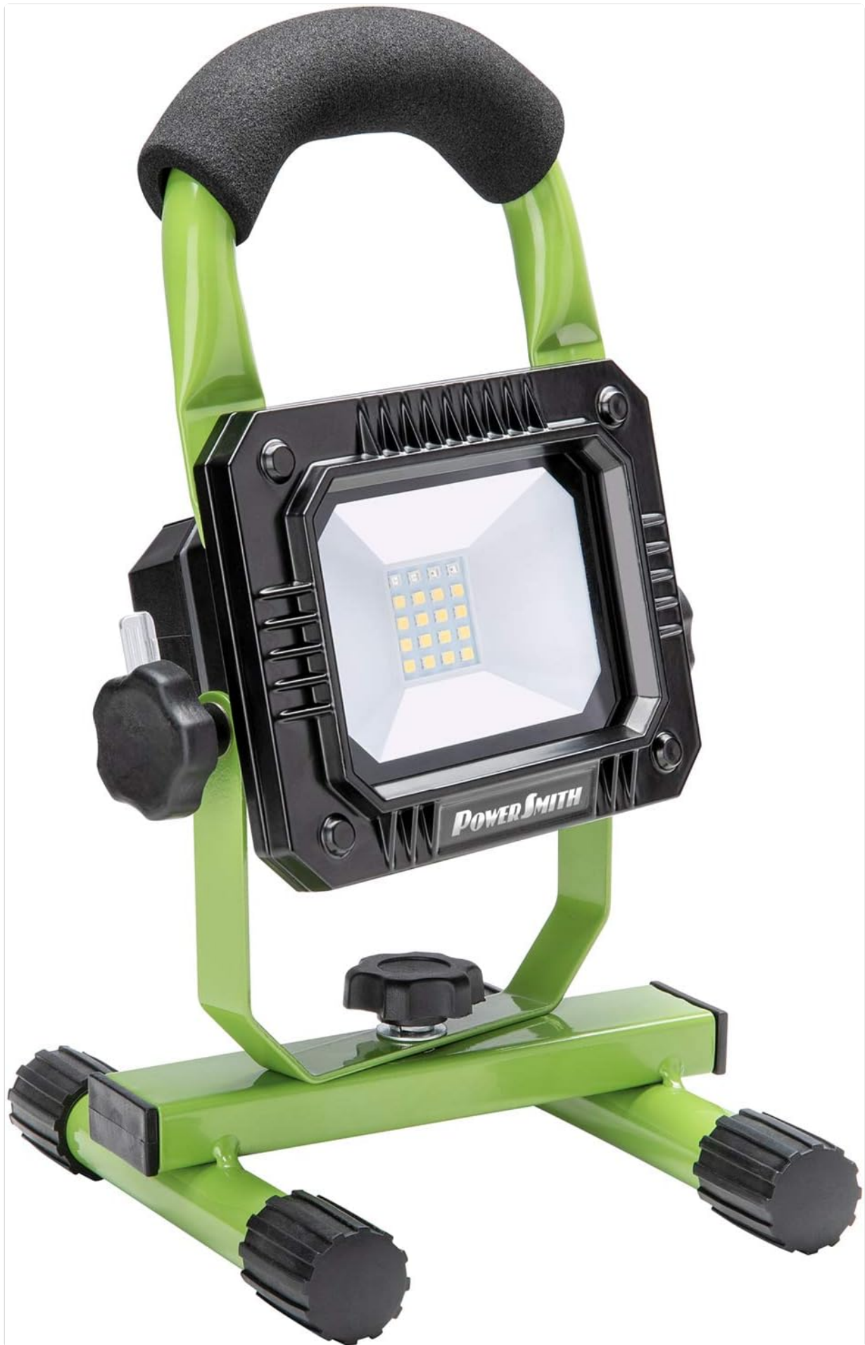
Figure 1: PowerSmith PWLR108S 800 Lumen Rechargeable LED Work Light. This image shows the overall design of the work light with its green metal stand and black LED housing.