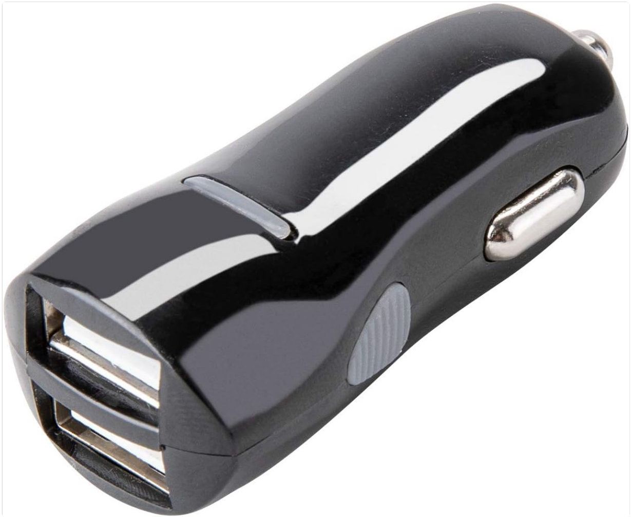
Figure 2: USB Power Cable and 12V DC Car Charger. These images display the included USB power cable and the 12V DC car charger, used for recharging the work light's internal battery.