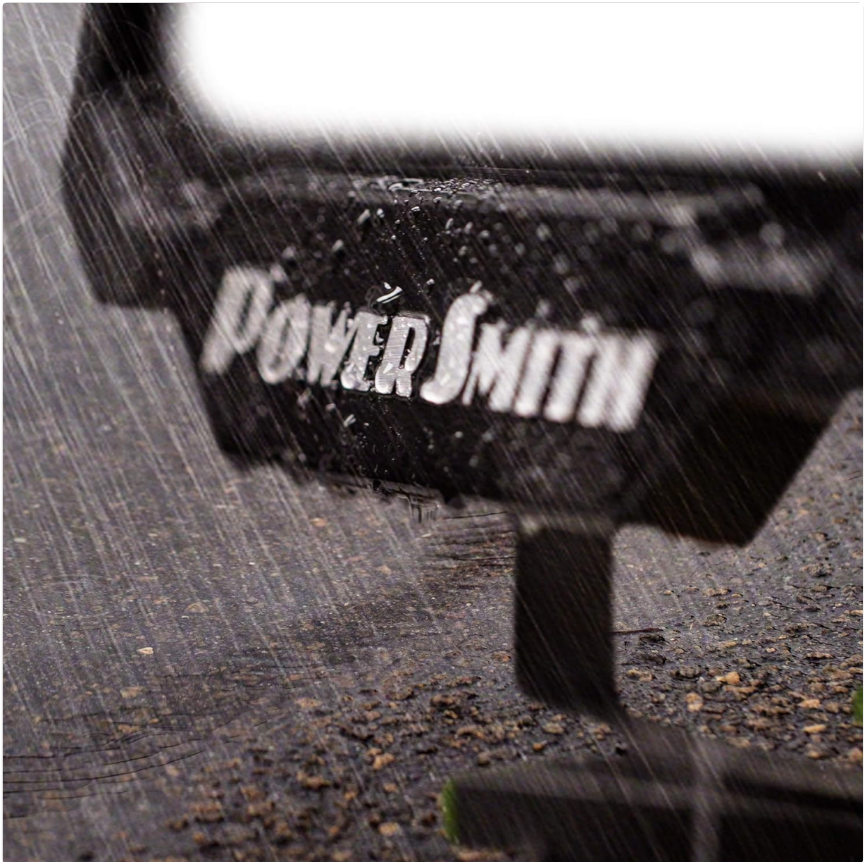
Figure 4: Weatherproof Design. This image shows the PowerSmith work light being exposed to water, demonstrating its weatherproof construction suitable for various environments.