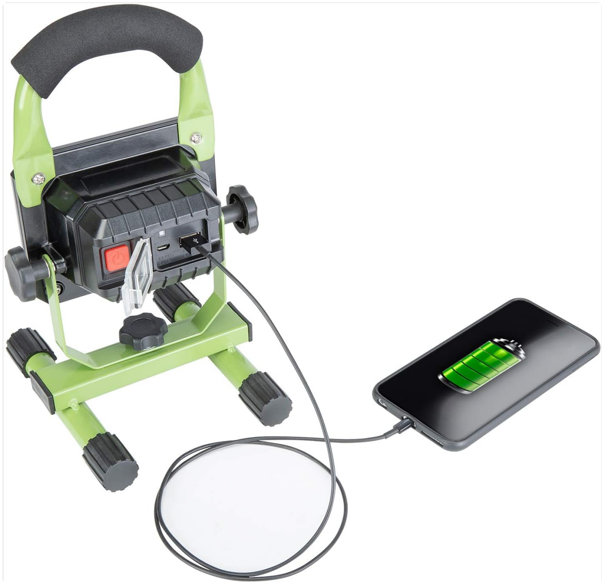
Figure 5: USB Device Charging. This image shows the PowerSmith work light connected via a USB cable to a smartphone, illustrating its capability to function as a power bank.