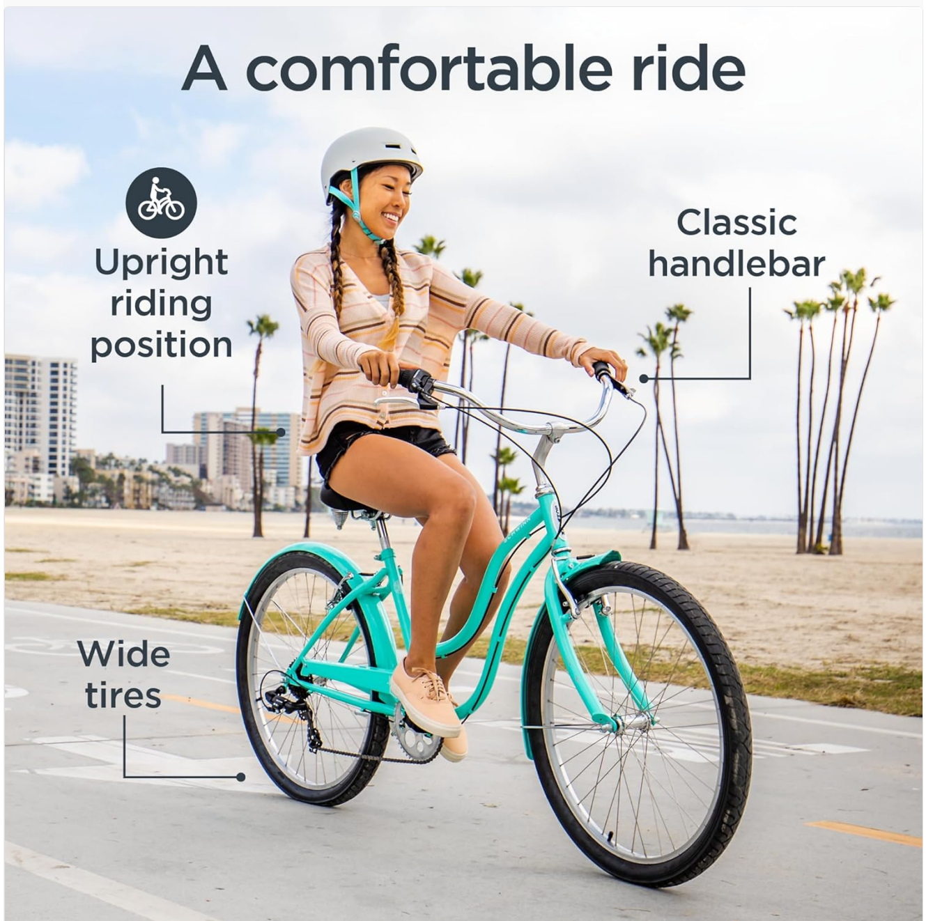
Image: Side view of the Schwinn Mikko 1-speed teal cruiser bike, showing the chain and pedal area for maintenance reference.