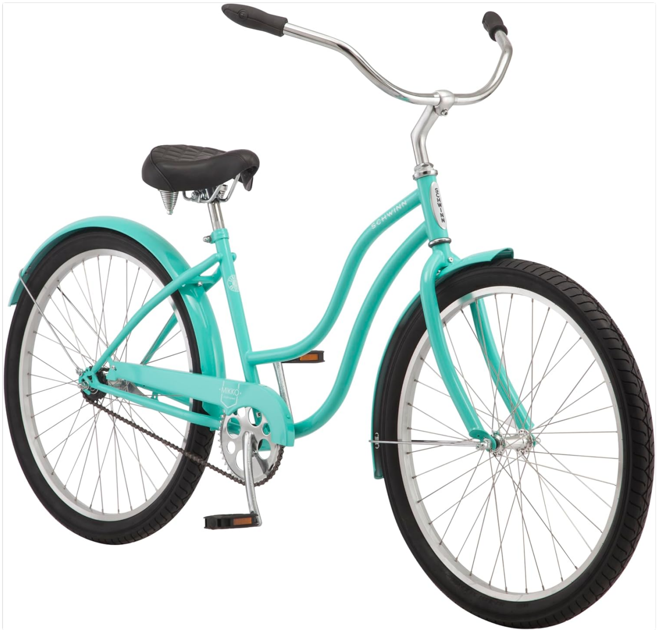
Image: Schwinn Mikko 1-speed beach cruiser bike in teal, showcasing its classic design.