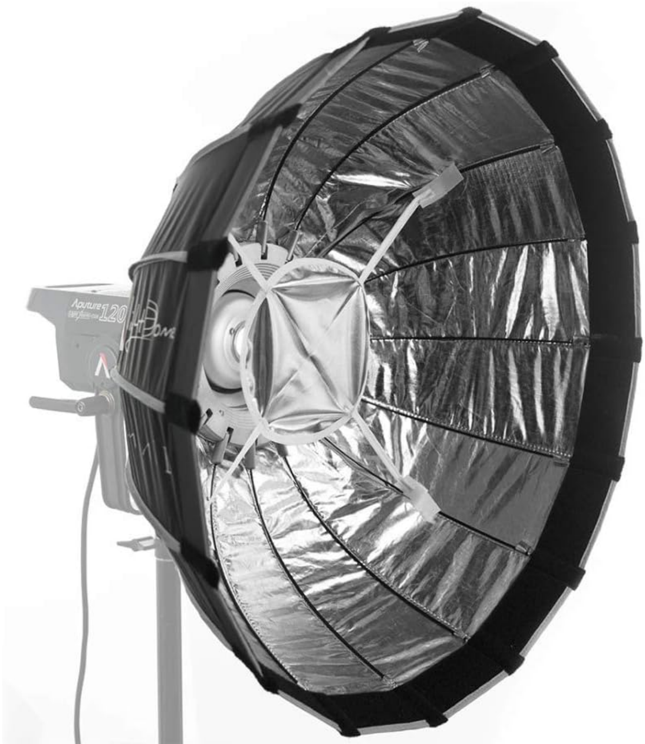
Figure 5: The Light Dome mini II mounted on an Aputure 120d, demonstrating its compact profile.