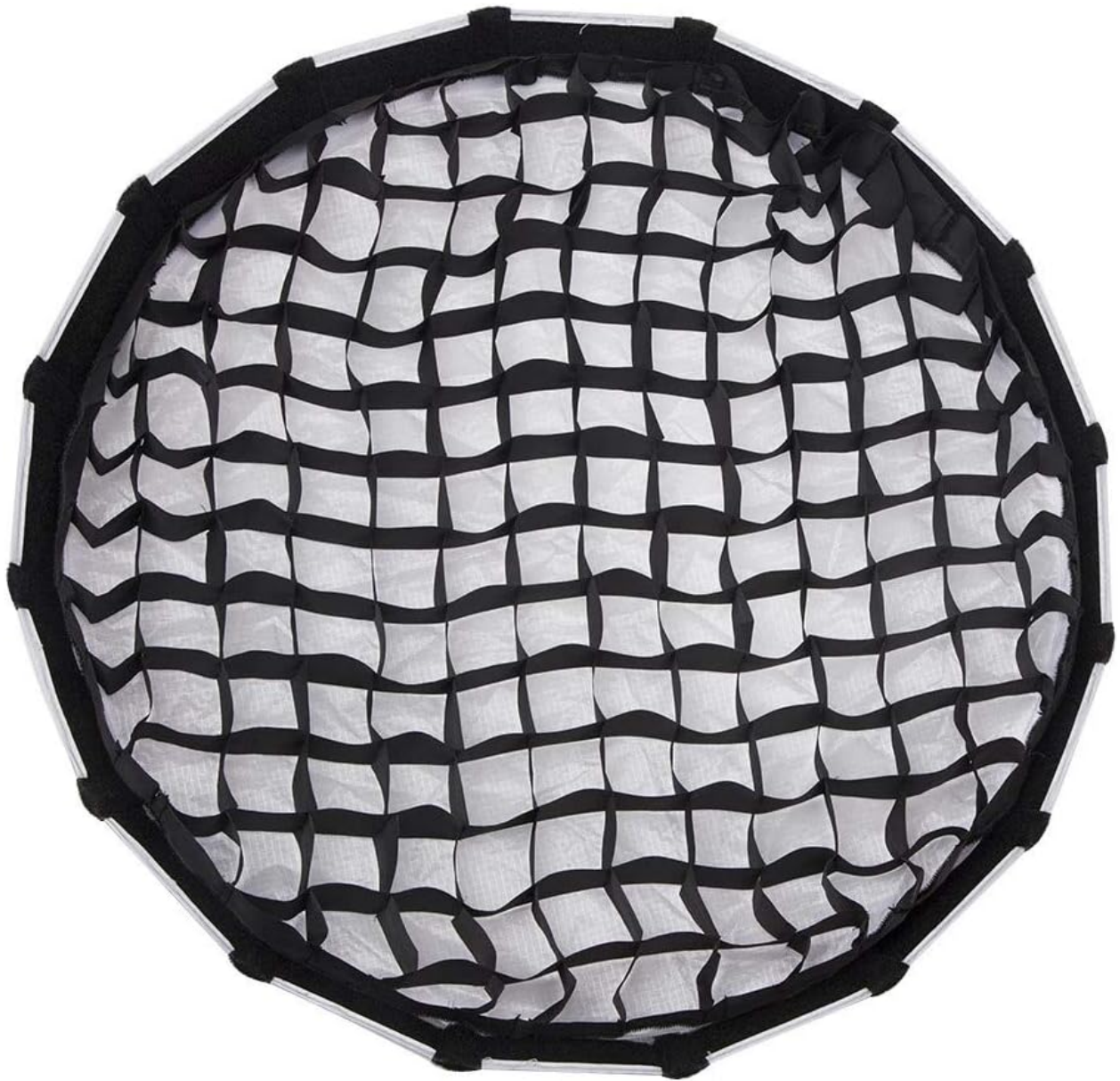
Figure 4: The 40° fabric grid provides directional control over the light.