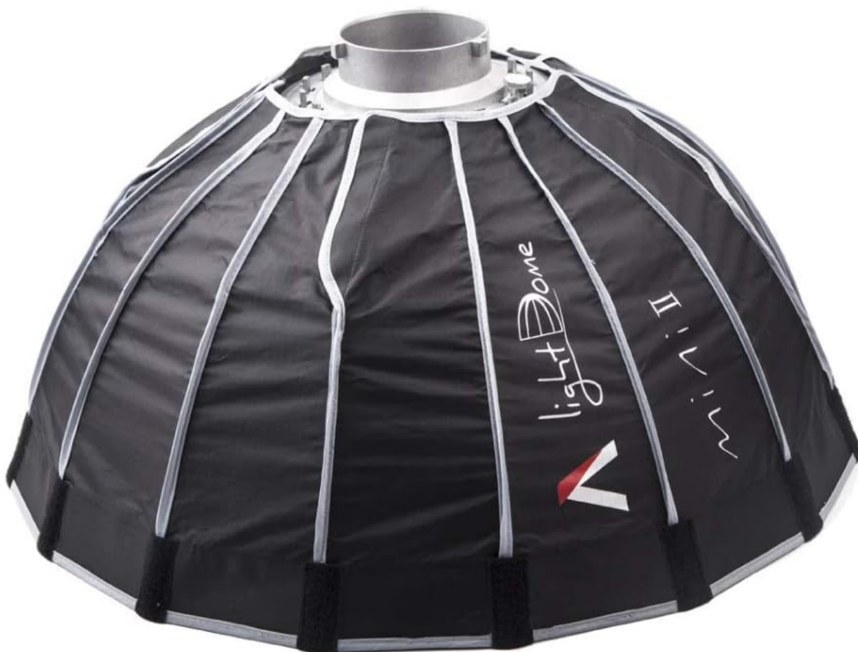
Figure 1: The Aputure Light Dome mini II, a compact parabolic softbox.

The Aputure Light Dome mini II is a compact and versatile light modifier designed to provide soft, even illumination for photography and videography. Its parabolic shape and silver interior maximize light output, while its quick setup and breakdown make it ideal for both studio and on-location use. Compatible with Bowens mount fixtures, this softbox is an essential tool for shaping light effectively.