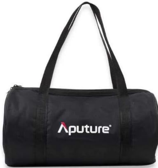
Figure 2: Included carrying bag for portability.