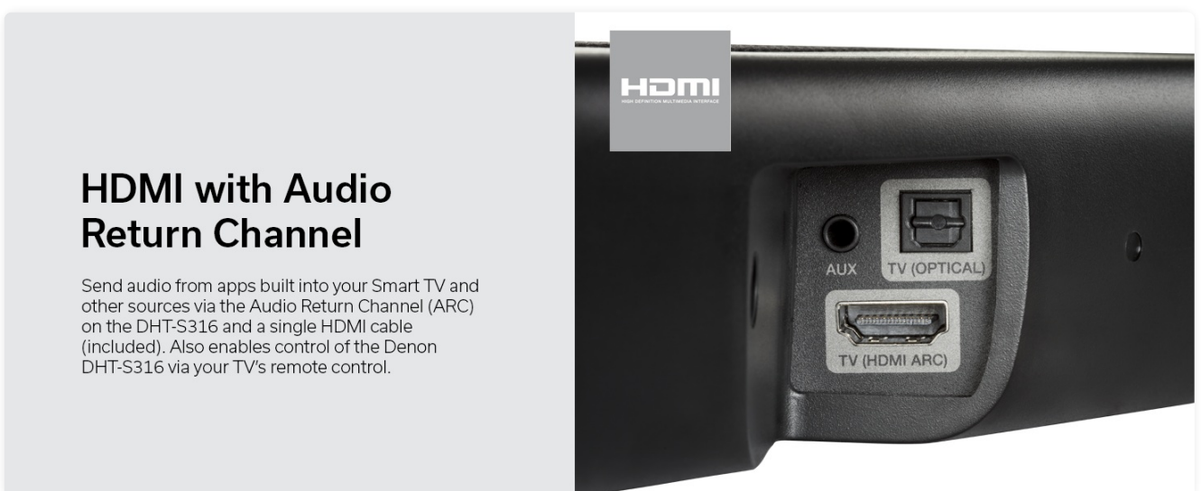
Figure 5: Illustrates the HDMI with Audio Return Channel (ARC) feature, showing the HDMI ARC port on the soundbar and its connection to a TV.