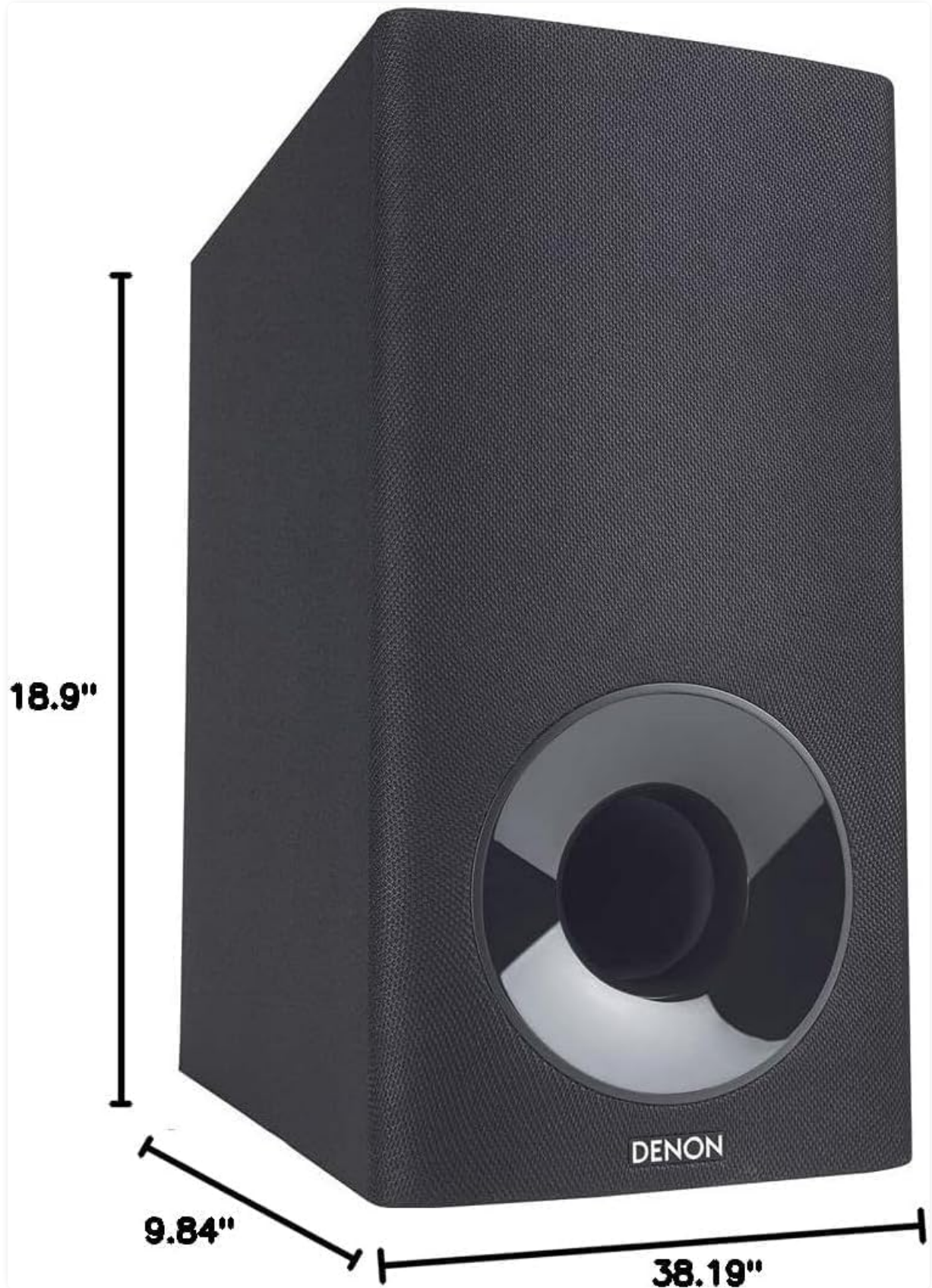
Figure 10: Visual representation of the product dimensions, showing the soundbar and subwoofer with their respective measurements.