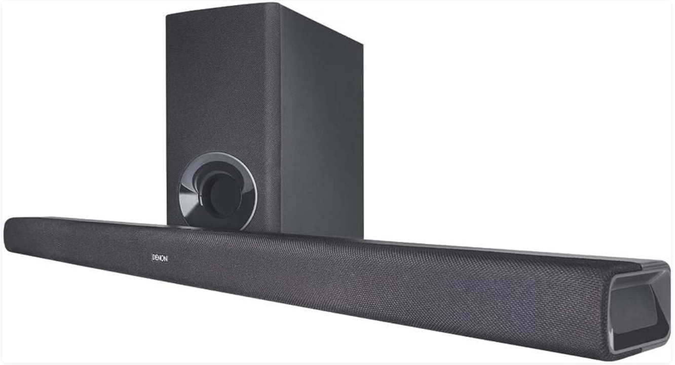
Figure 1: Denon DHT-S316 Soundbar and Wireless Subwoofer. The soundbar is a long, slim black unit, and the subwoofer is a rectangular black box with a circular port on the front.