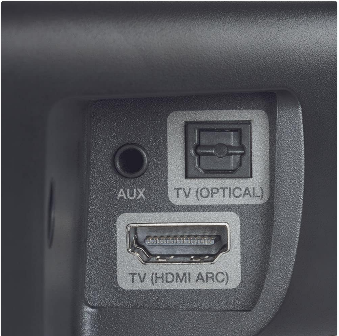
Figure 4: Close-up view of the soundbar's rear panel, showing the AUX, TV (OPTICAL), and TV (HDMI ARC) input ports.