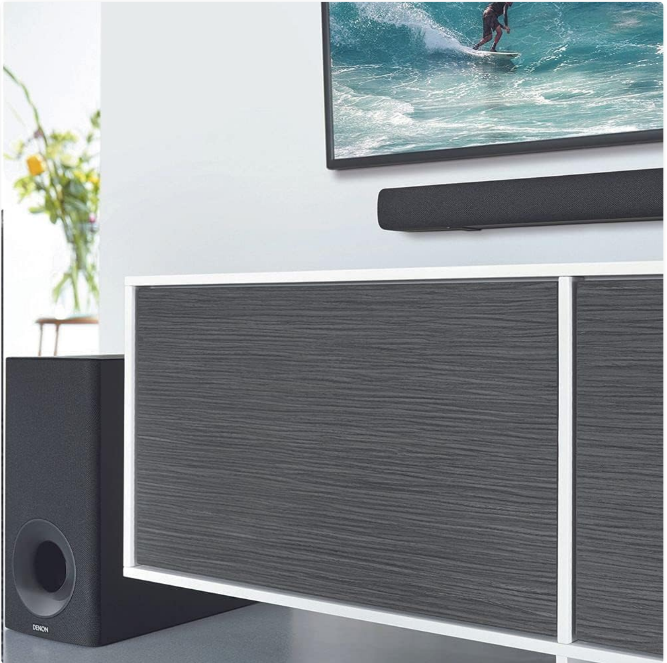
Figure 3: Example of the soundbar placed below a wall-mounted TV and the wireless subwoofer positioned next to a media console.