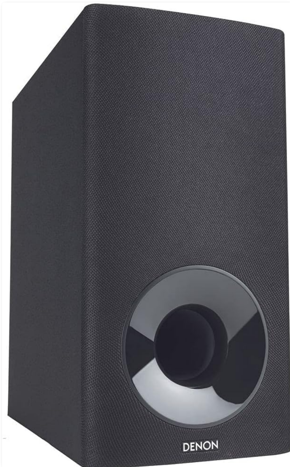
Figure 2: Close-up view of the Denon DHT-S316 wireless subwoofer, highlighting its compact design and front-firing port.