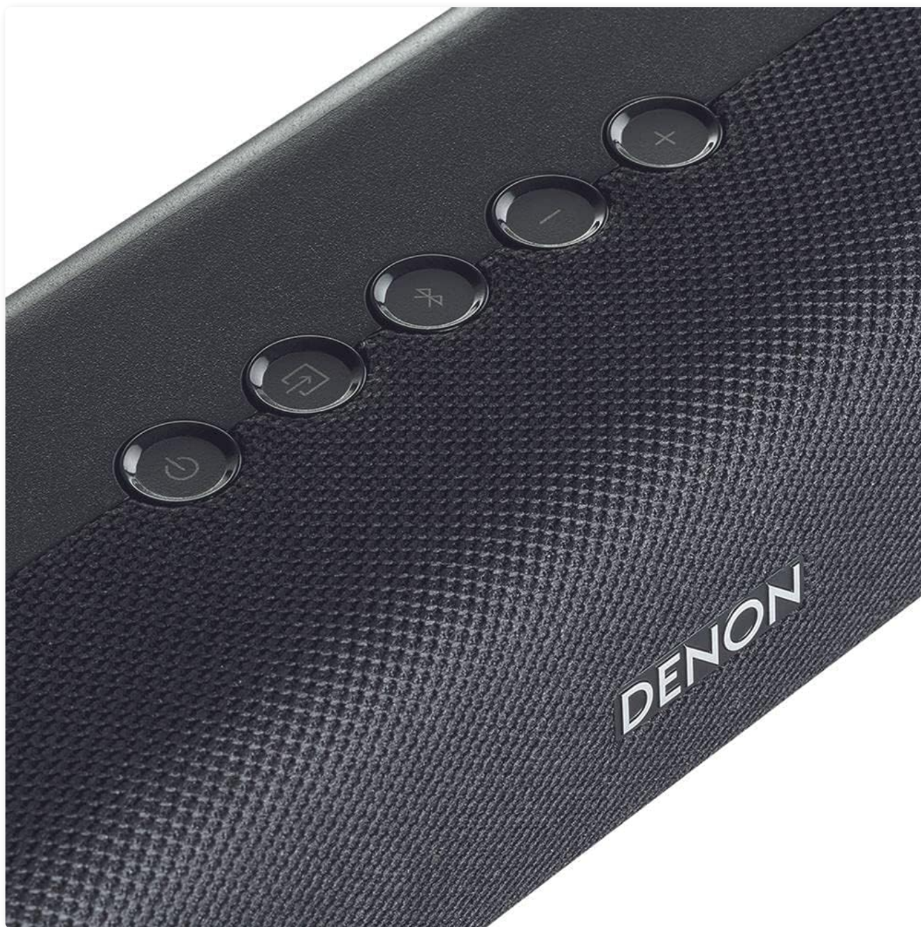
Figure 6: Close-up of the soundbar's top panel, showing the power, input, Bluetooth, and volume control buttons.

Press the Power button on the soundbar's top panel or the remote control to turn the system on or off. The soundbar will automatically power on when it detects an audio signal from the connected TV via HDMI ARC.