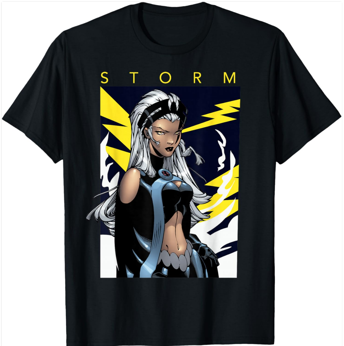
Figure 1: Front view of the Marvel X-Men Storm Boltage Voltage Poster Graphic T-Shirt, featuring a dynamic graphic of Storm against a lightning bolt background.