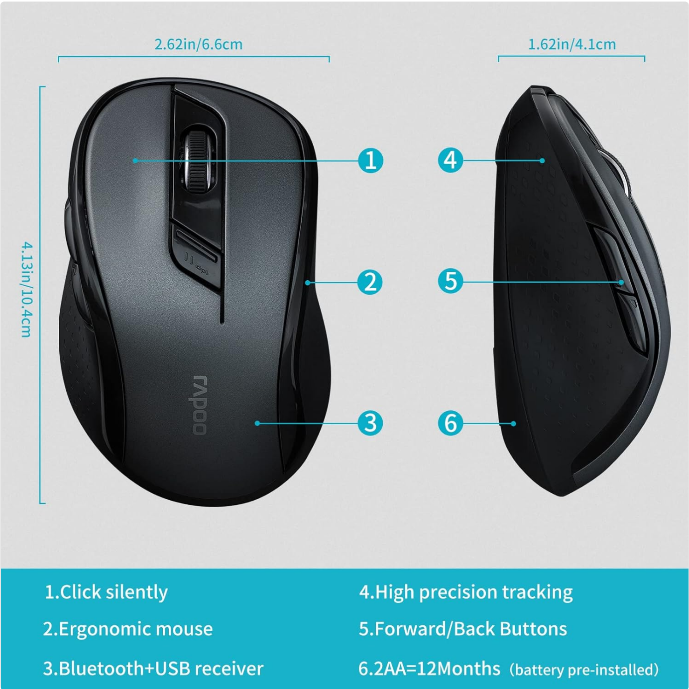
A detailed diagram of the Rapoo M500 mouse highlighting its key features with numbered callouts: 1. Silent Click, 2. Ergonomic design, 3.