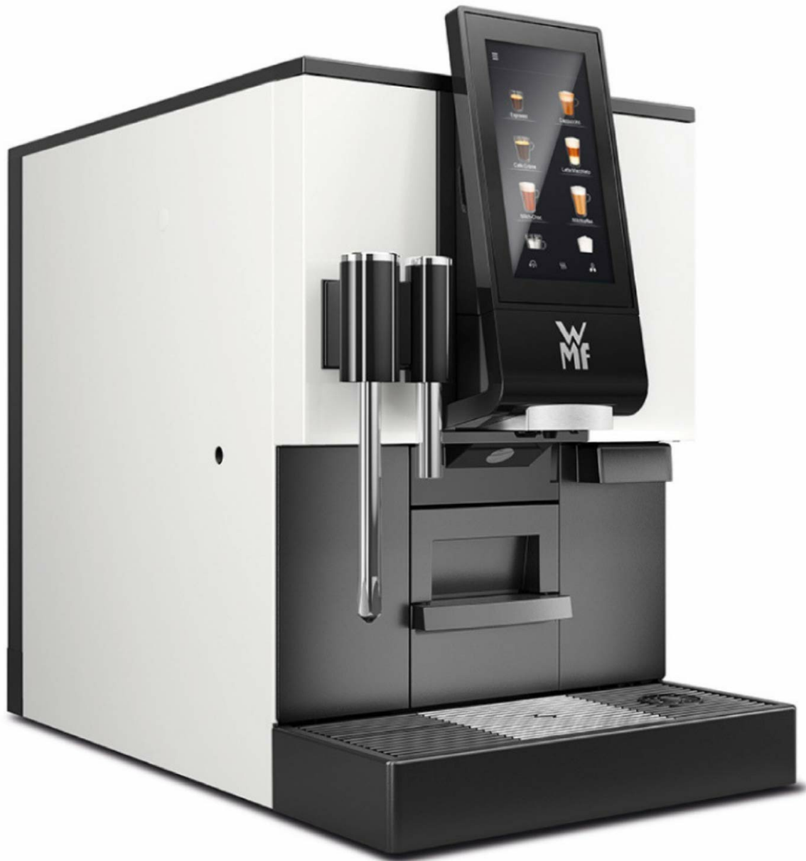
Figure 1: Front view of the WMF 1100S Super Automatic Coffee Machine.