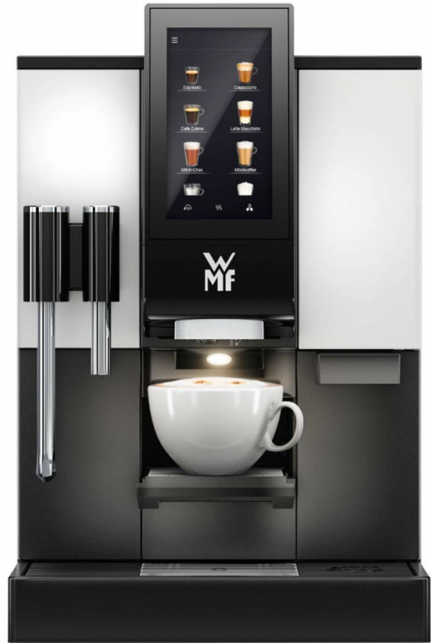
Figure 5: The intuitive touch display for beverage selection.

With its vertical swipe function, the intuitive service design of the 7 inch touch display enables quick and purposeful guidance through the various menus – Sophisticated ergonomics that simplify more than just the self-service area. Animated descriptions offer staff effective service support. Favourite recipes, images and background colours can be easily recorded. And there is also the option of customising templates.