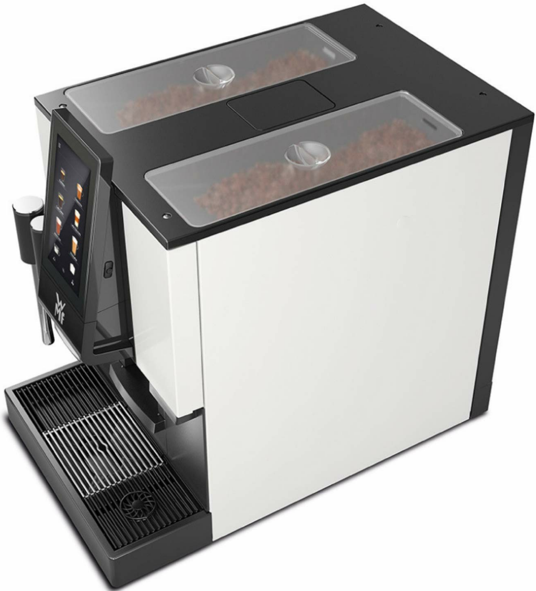
Figure 4: Top view of the WMF 1100S, illustrating the coffee bean hoppers.

The machine supports "Plug&Play" for easy self-setup.