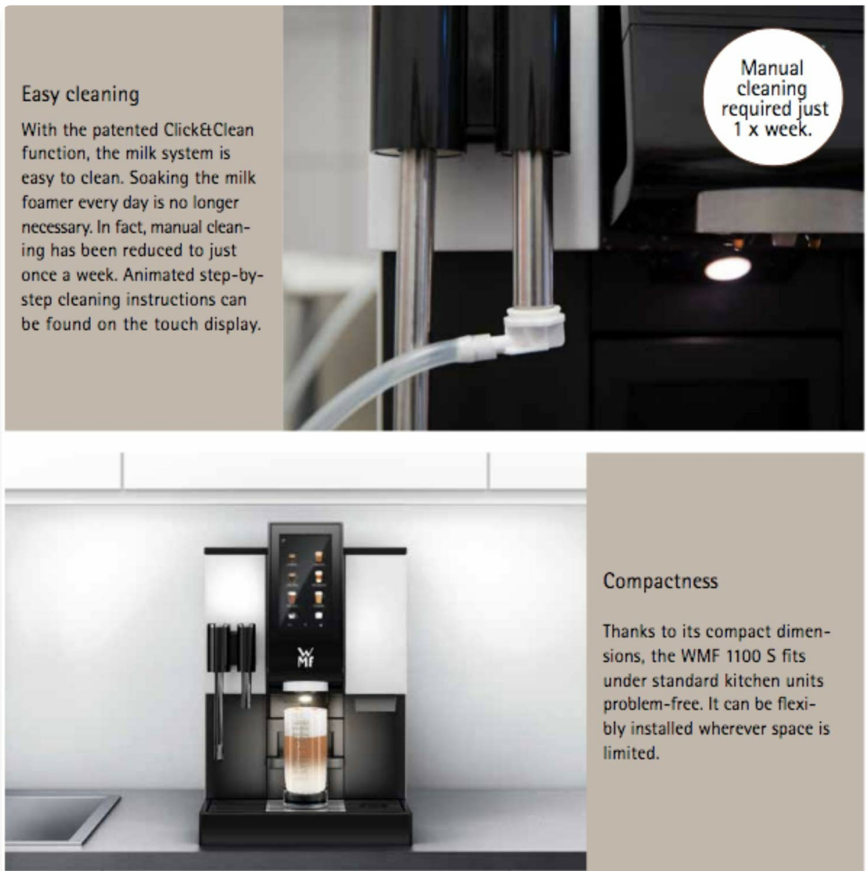
Figure 2: The WMF 1100S is designed for compact installation, fitting under standard kitchen units.

Place the machine on a stable, level, and heat-resistant surface. Ensure adequate ventilation around the machine. The compact dimensions allow for flexible installation.