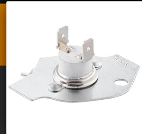
Figure 2: Detailed view of the WP3977767 dryer thermostat, WP3387134 cycle thermostat, WP3392519 thermal fuse, and 3977393 thermal cut-off switch.