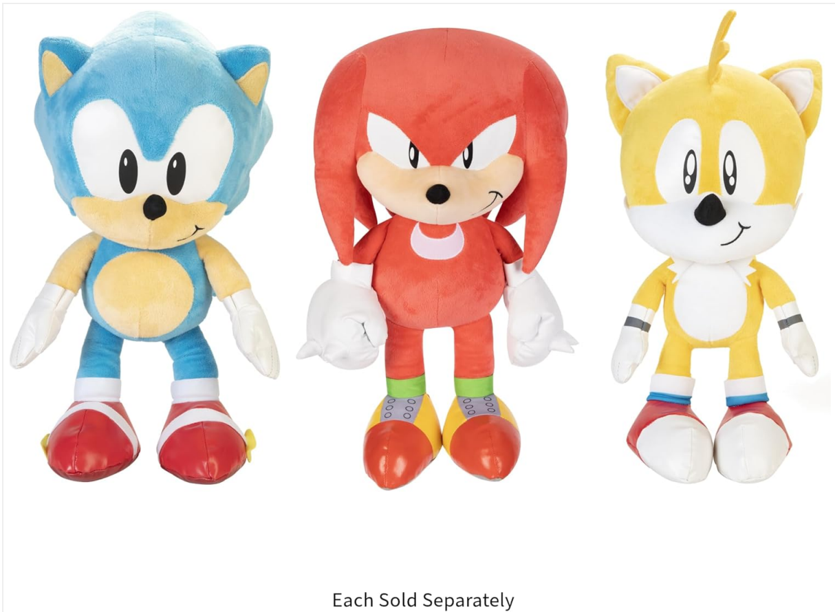
Figure 3.1: Sonic Plush demonstrating connectable hands with another character.

Engage in creative play scenarios with Sonic. The hook and loop fasteners on Sonic's hands allow him to connect with other compatible plush characters, such as Tails (sold separately), mimicking their in-game interactions.