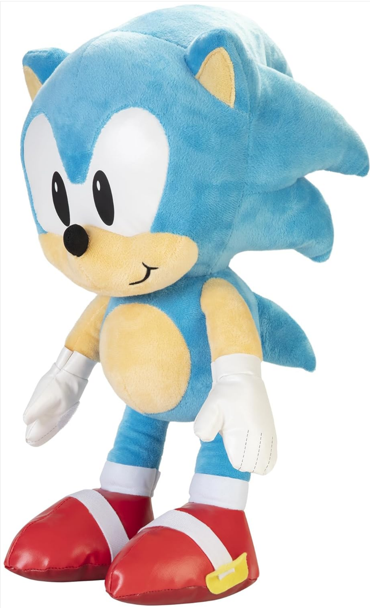
Figure 2.1: Front view of the Sonic Jumbo Plush.