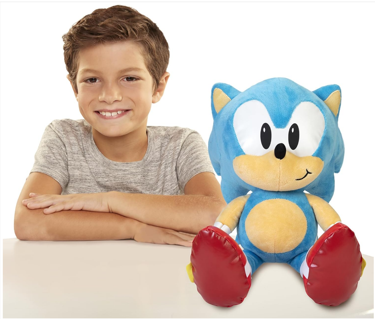
Figure 3.2: Sonic Plush displayed with a child.