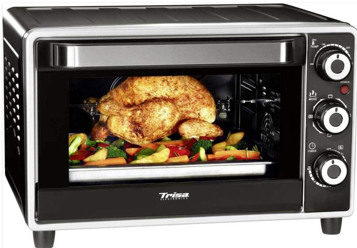
Image 1.1: The Trisa Forno Gusto Toaster Oven, showcasing its interior with a roasted chicken and vegetables, highlighting its cooking capabilities and rotisserie function.

The Trisa Forno Gusto is a versatile 23-liter toaster oven with 1600W power, featuring convection and automatic rotisserie functions, designed for various cooking tasks from toasting to roasting.