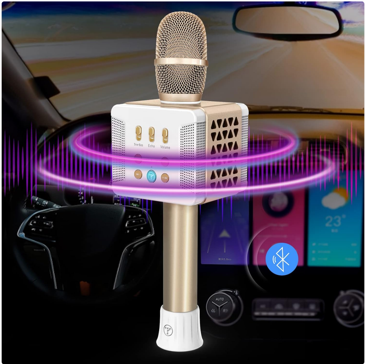
Image: The TOSING 016 microphone connected via Bluetooth inside a car, demonstrating wireless audio streaming.