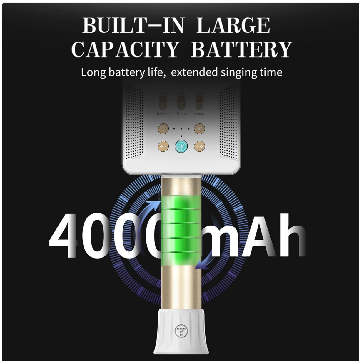
Image: Illustration of the 4000mAh built-in battery and its charge indicator.

Carefully remove the microphone and included accessories (USB cable, warranty card) from the packaging. Before first use, fully charge the device using the provided USB cable. The battery indicator lights will show charging progress.