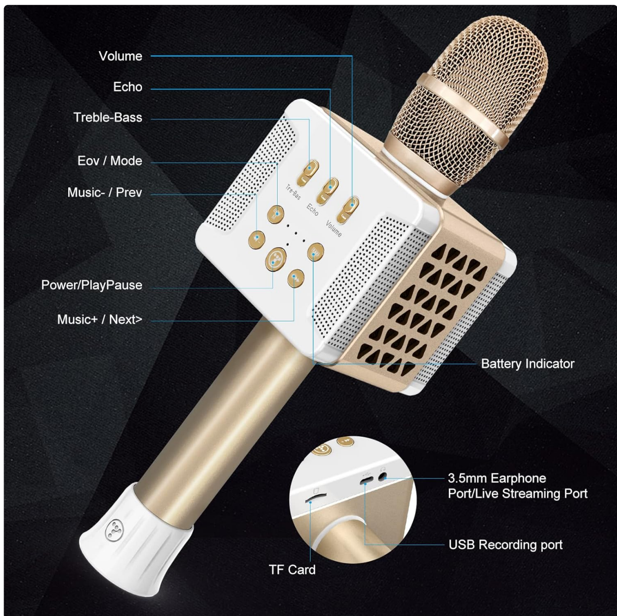
Image: A detailed diagram labeling the various buttons and ports on the TOSING 016 microphone, including Volume, Echo, Treble-Bass, EOV/Mode, Music-/Prev, Power/Play/Pause, Music+/Next, Battery Indicator, 3.5mm Earphone Port/Live Streaming Port, TF Card slot, and USB Recording Port.