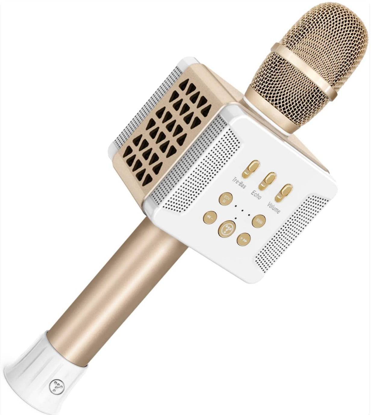
Image: The TOSING 016 Karaoke Microphone, showcasing its gold and white design with integrated speakers.