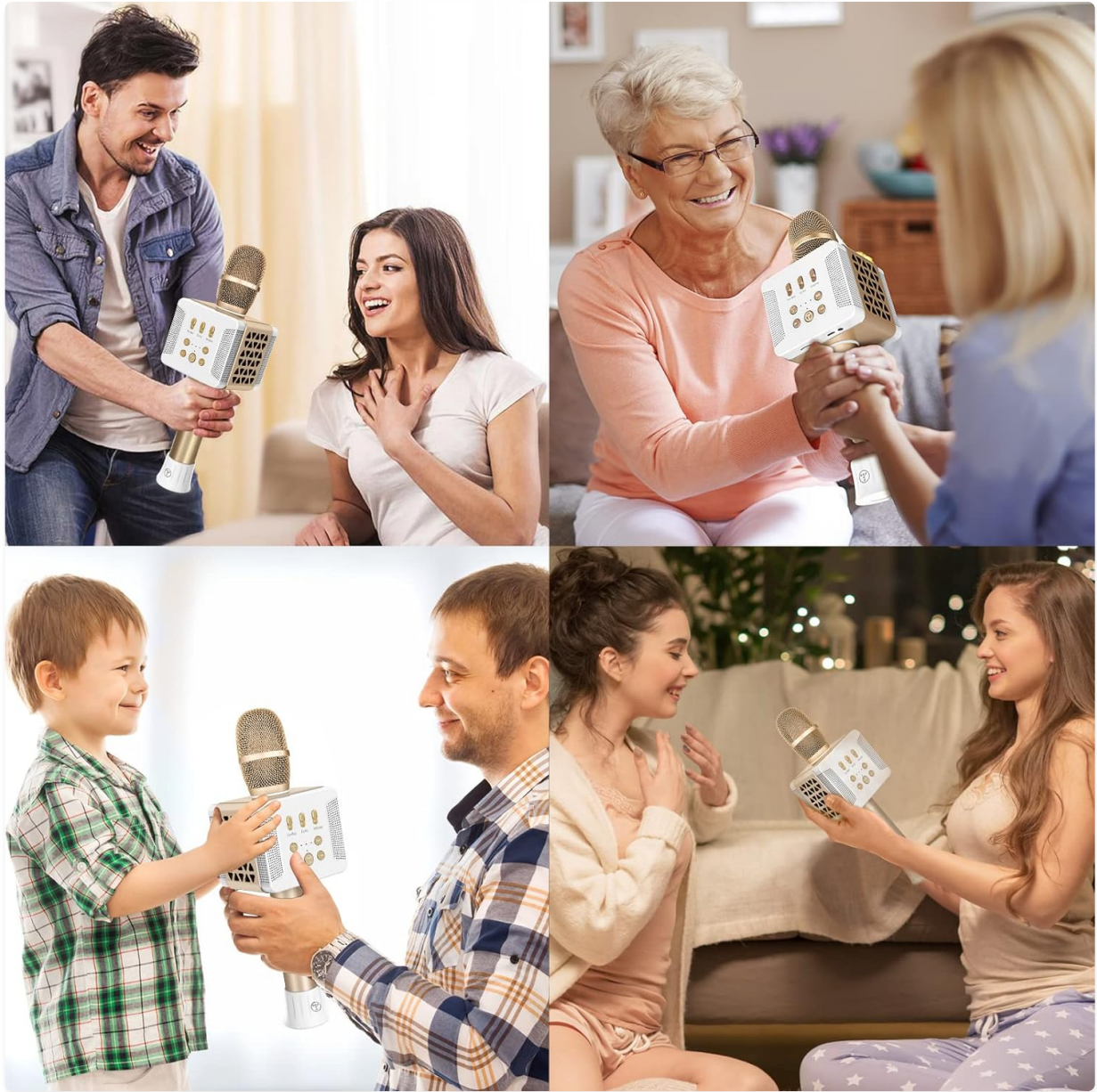
Image: A collage of individuals and groups using the TOSING 016 microphone for karaoke and singing activities.

Once connected via Bluetooth to your device, open your preferred karaoke app or music player. Play your chosen song and sing along into the microphone. Adjust the microphone volume, echo, treble, and bass controls on the microphone itself to achieve your desired vocal effect.