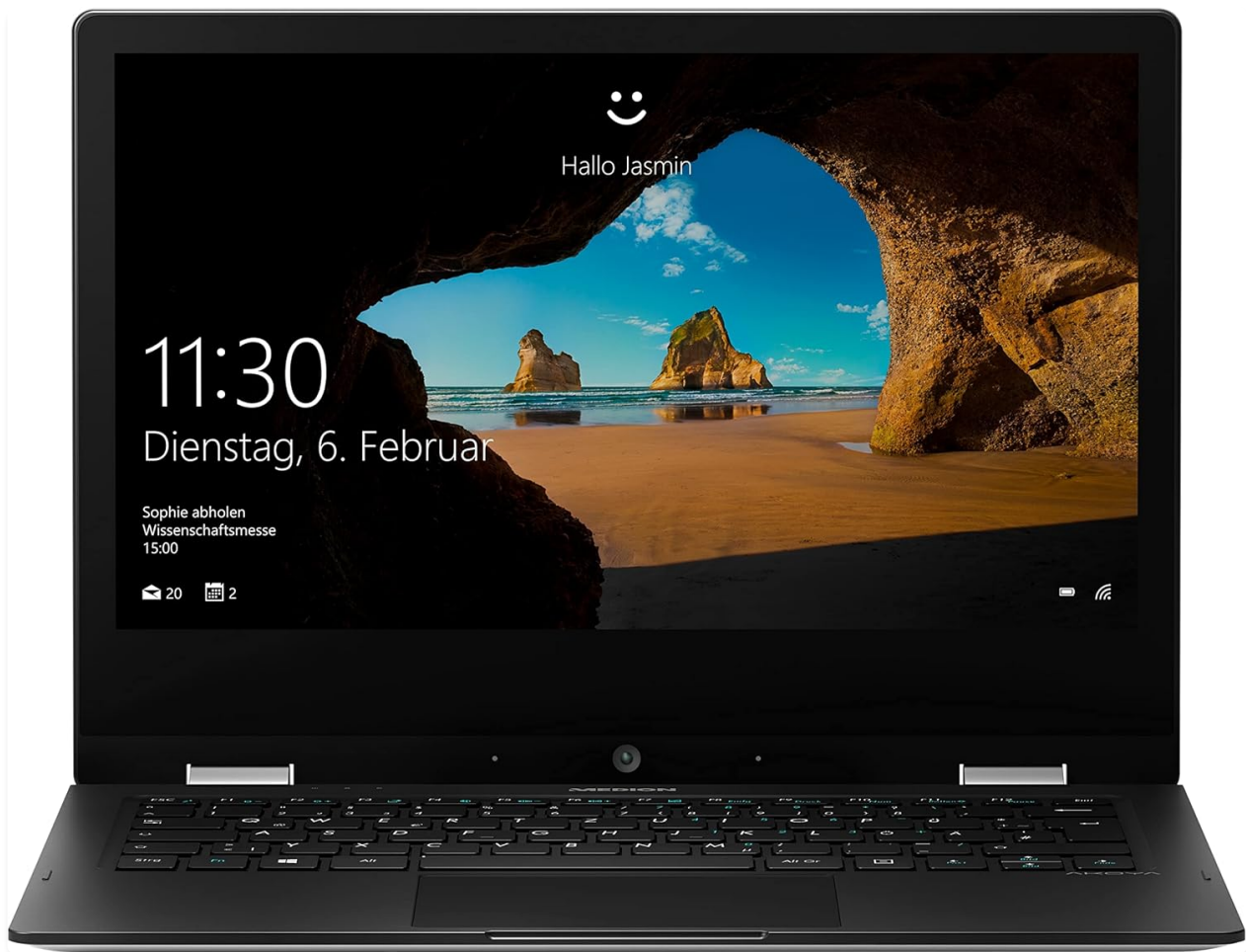
Image: A close-up view of the MEDION E3221 laptop screen displaying the Windows login interface.