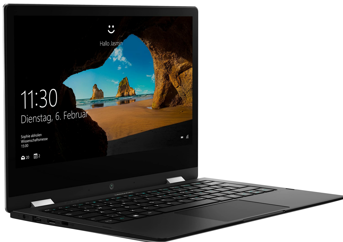
Image: The MEDION E3221 laptop demonstrating its 360-degree hinge and multiple usage modes.