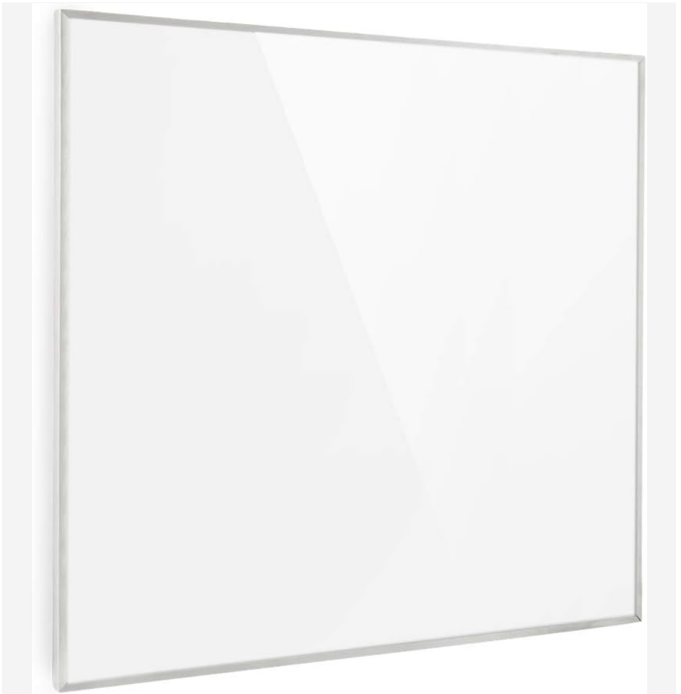
Figure 1: Front view of the Klarstein Wonderwall Infrared Heater, showcasing its minimalist white panel design.