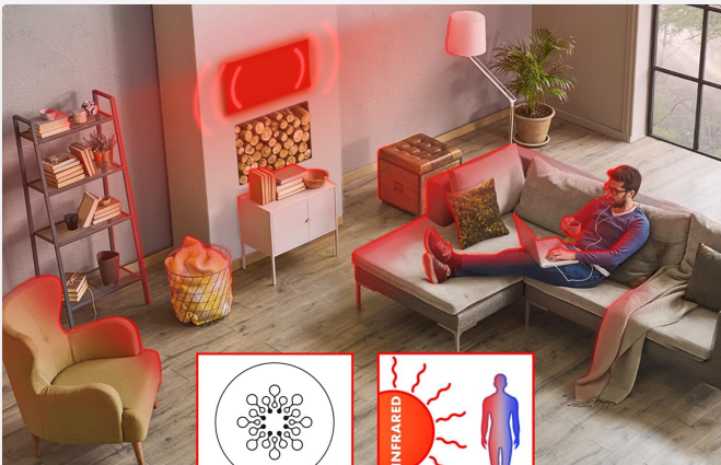
Figure 2: The heater's high efficiency, converting up to 95% of supplied energy into thermal radiation, providing warmth in a living room setting.

Up to 95% of the supplied energy is converted into thermal radiation