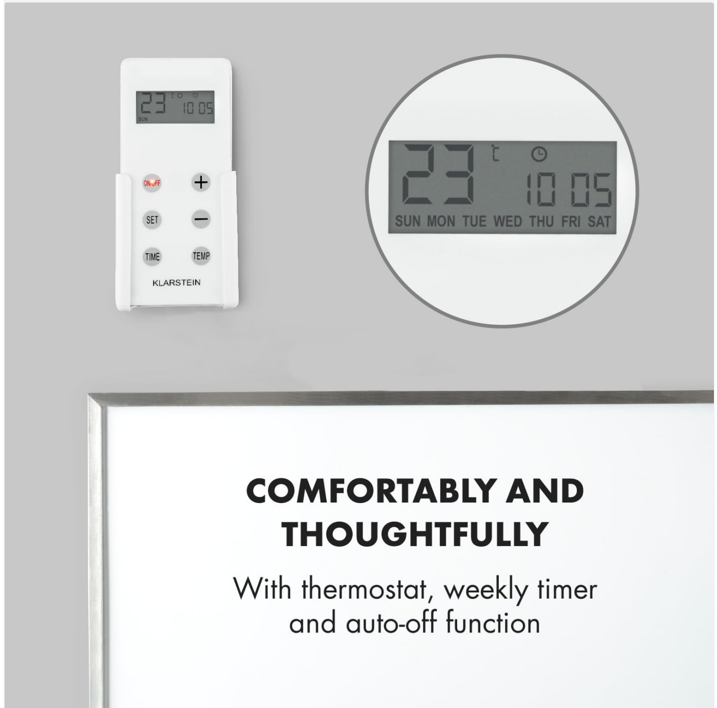
Figure 7: The remote control and digital display for setting temperature, time, and weekly timer functions.

The integrated thermostat allows you to set your desired room temperature. The heater will automatically adjust its operation to maintain this temperature, optimizing energy consumption.