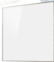
Figure 5: Ideal for allergy sufferers, the fan-less operation prevents dust from being whirled up, ensuring cleaner air.

Works without fan, which prevents dust from whirling up