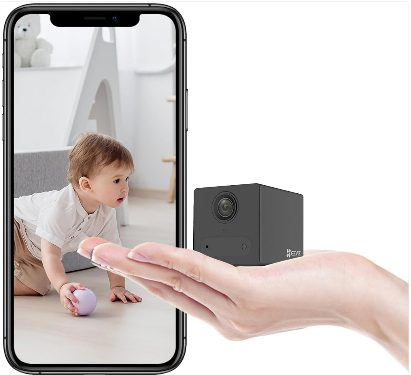
The EZVIZ CB2 camera is compact and designed for easy monitoring, allowing users to view live footage directly on their smartphone.