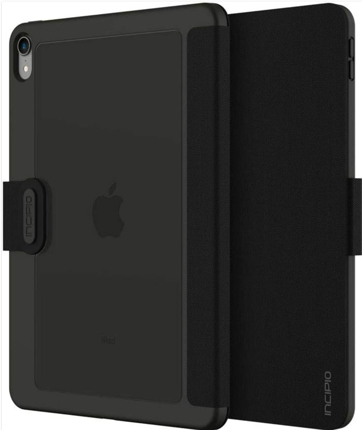
Image 1.1: Incipio Clarion Folio Case with an iPad inserted, showcasing the transparent back and open cover.