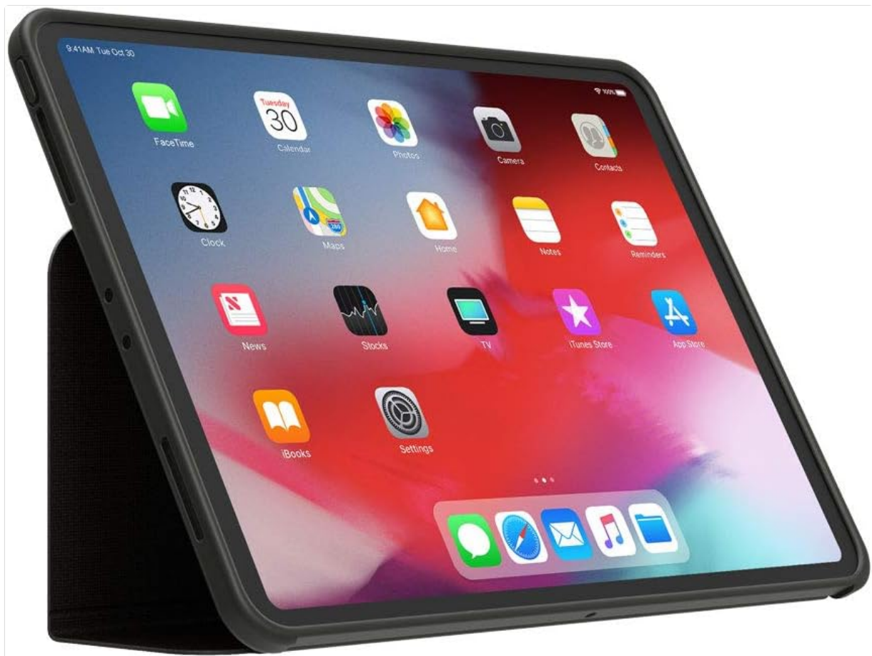
Image 3.2: The Incipio Clarion Folio Case adjusted to a lower angle, ideal for typing or drawing on the iPad.