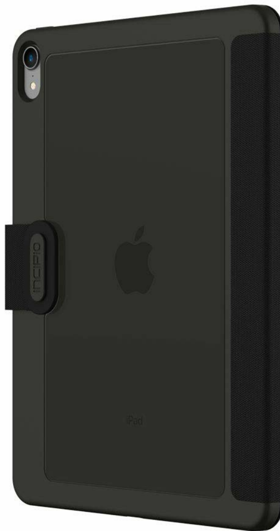
Image 2.1: Rear view of the Incipio Clarion Folio Case with an iPad, illustrating the precise cutouts for the camera and the transparent back.