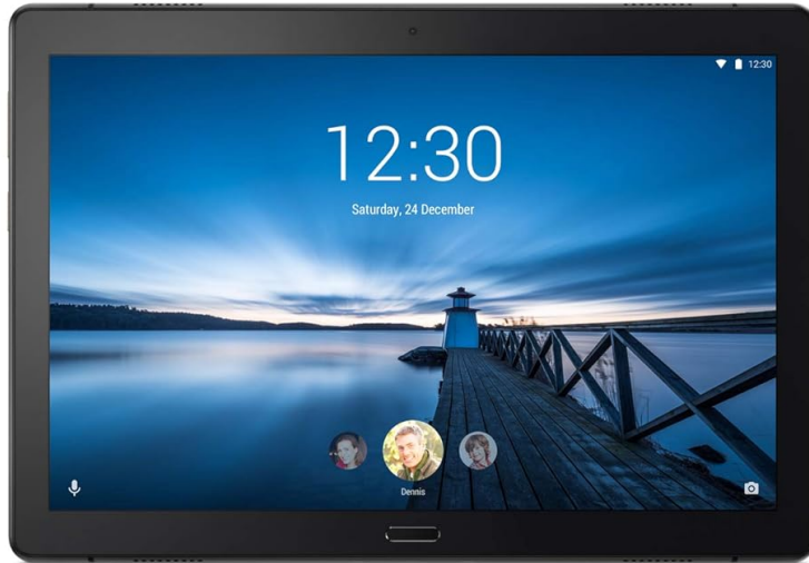
Figure 3.1: Front view of the Lenovo Tab P10, showing the display, front camera, and home screen interface.