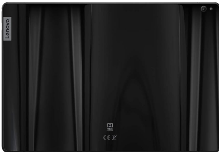
Figure 3.2: Back view of the Lenovo Tab P10, highlighting the design and rear camera placement.