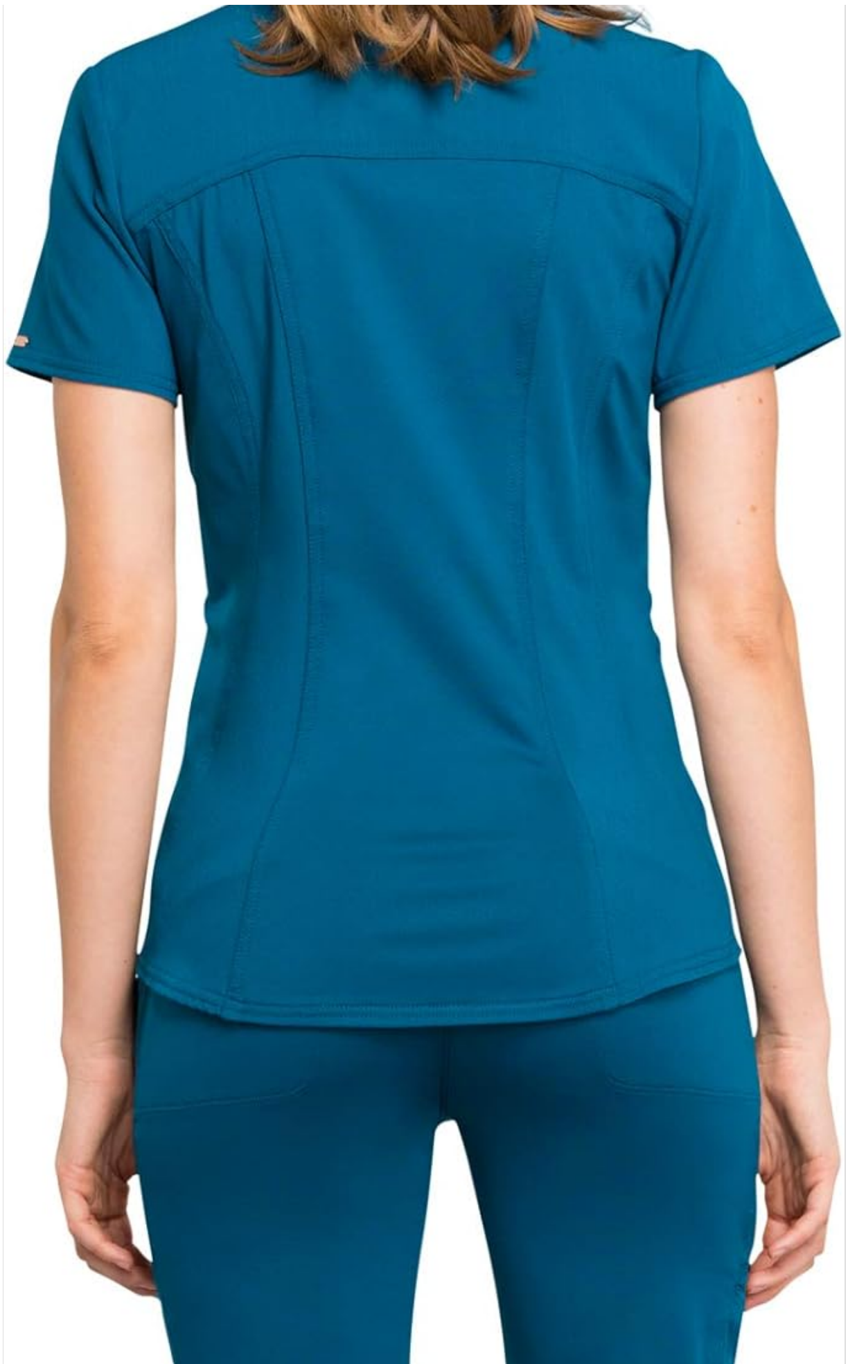
This image shows the overall design of the Cherokee Statement CK795 top, highlighting its V-neck and contemporary fit.