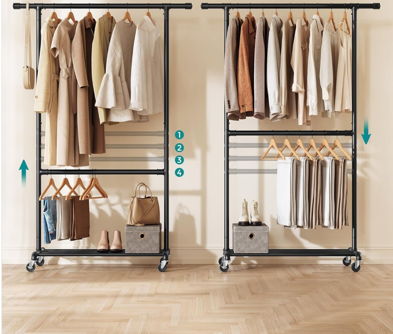
Image: Adjustable middle rail for different garment lengths.