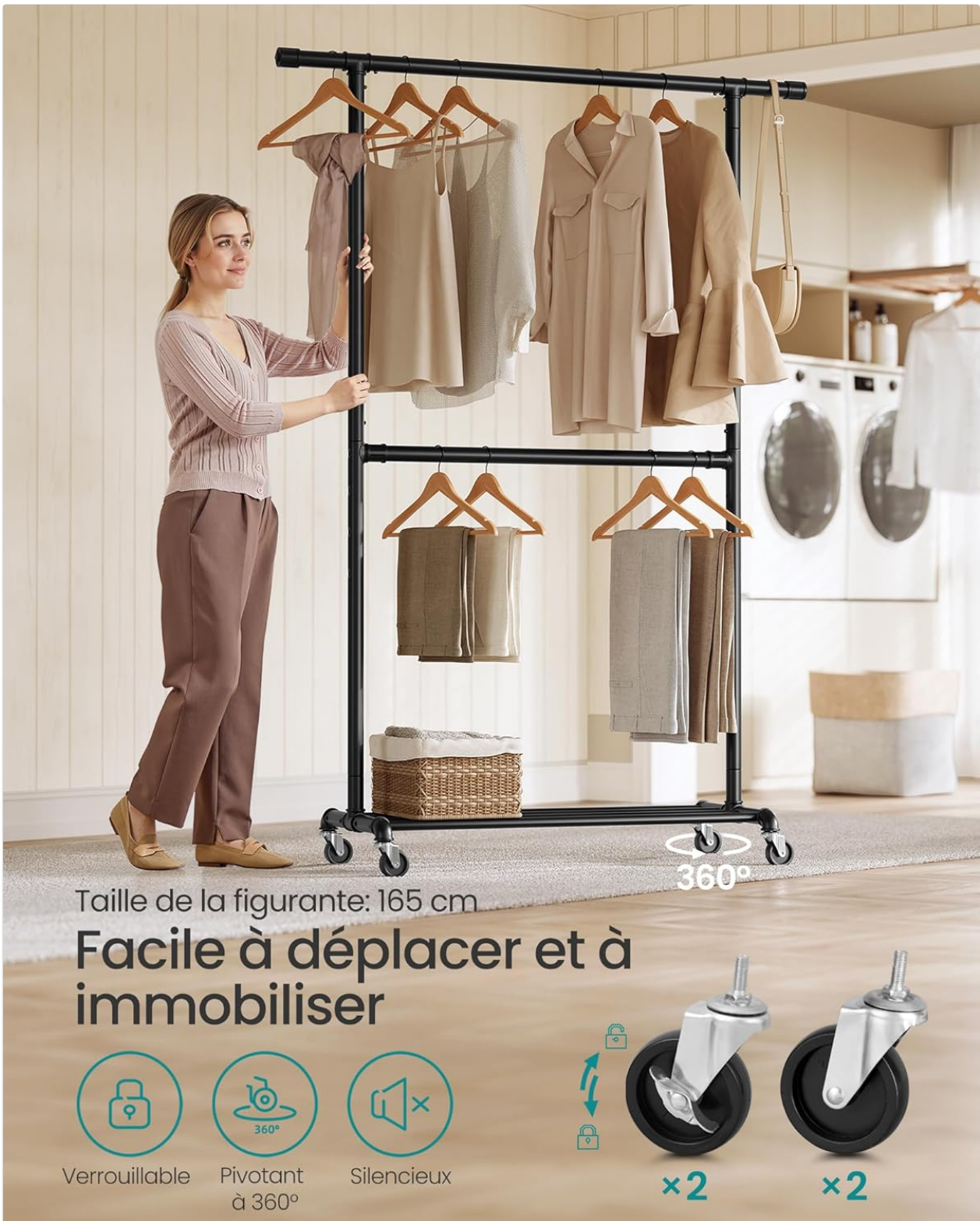
Image: Universal wheels with locking mechanism.