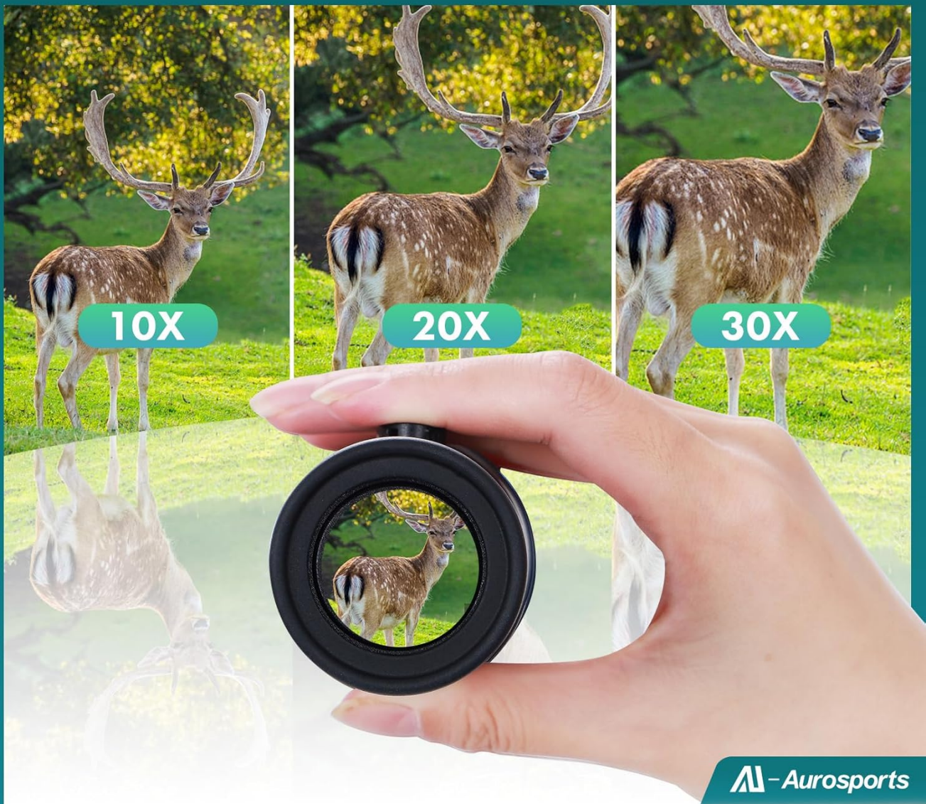
Image 5.1: Illustrates the effect of 10x, 20x, and 30x zoom on a distant object, demonstrating the variable magnification capability of the monocular.