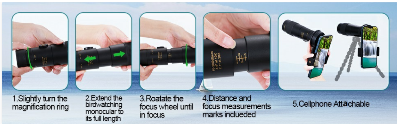
Image 5.2: Shows the monocular being used with a smartphone adapter and tripod, demonstrating how to attach a phone for magnified photography or video recording.