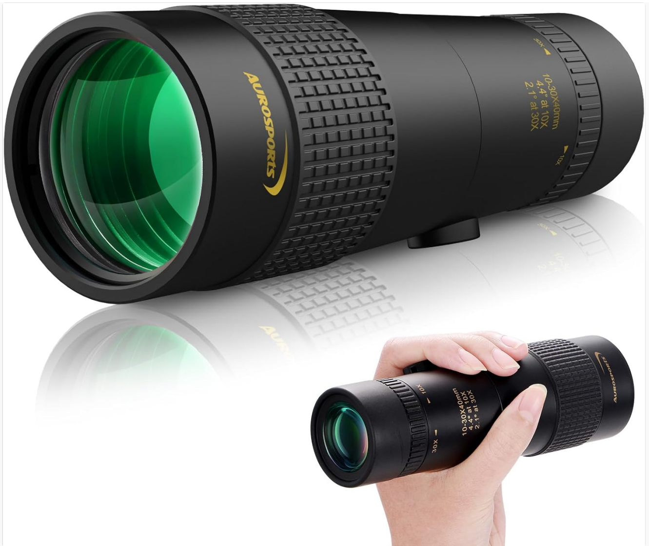
Image 1.1: The Aurosports 10-30x40 Zoom Monocular, a compact optical device for magnified viewing.