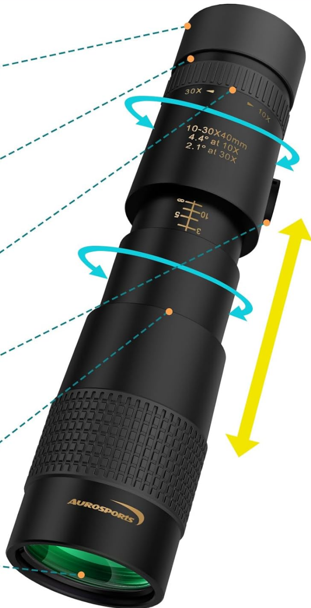
Image 2.1: Labeled diagram illustrating the key components of the monocular, including the eye lens, adjustable eyecups, magnification adjustment wheel, concealed rope and tripod connector, adjustable focus ring, and object lens.