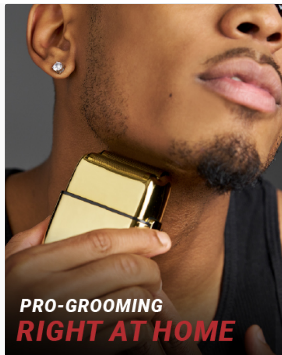
Figure 2: The hypoallergenic double foils are suitable for sensitive skin, providing a smooth finish.