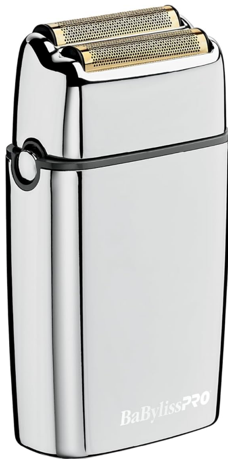
Figure 1: BaBylissPRO METALFX Double Foil Shaver (Silver model).