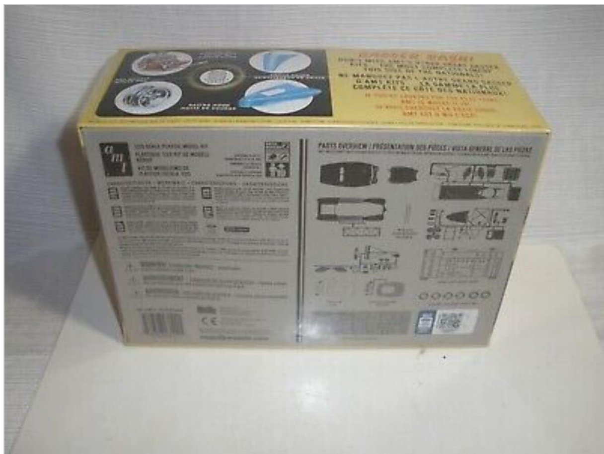
Figure 3.2: Rear view of the model kit box, showing a diagram of included parts and build options.

Before starting, carefully inspect all parts against the included parts list (usually found on the instruction sheet or box interior) to ensure all components are present and undamaged. Familiarize yourself with the different sprues and their corresponding part numbers.