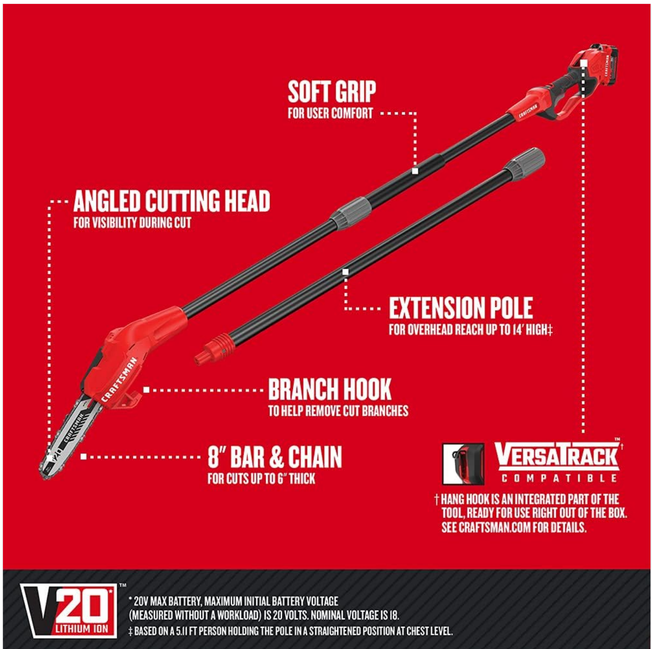
Figure 2: Diagram highlighting key features including soft grip, angled cutting head, extension pole, branch hook, and 8-inch bar & chain.