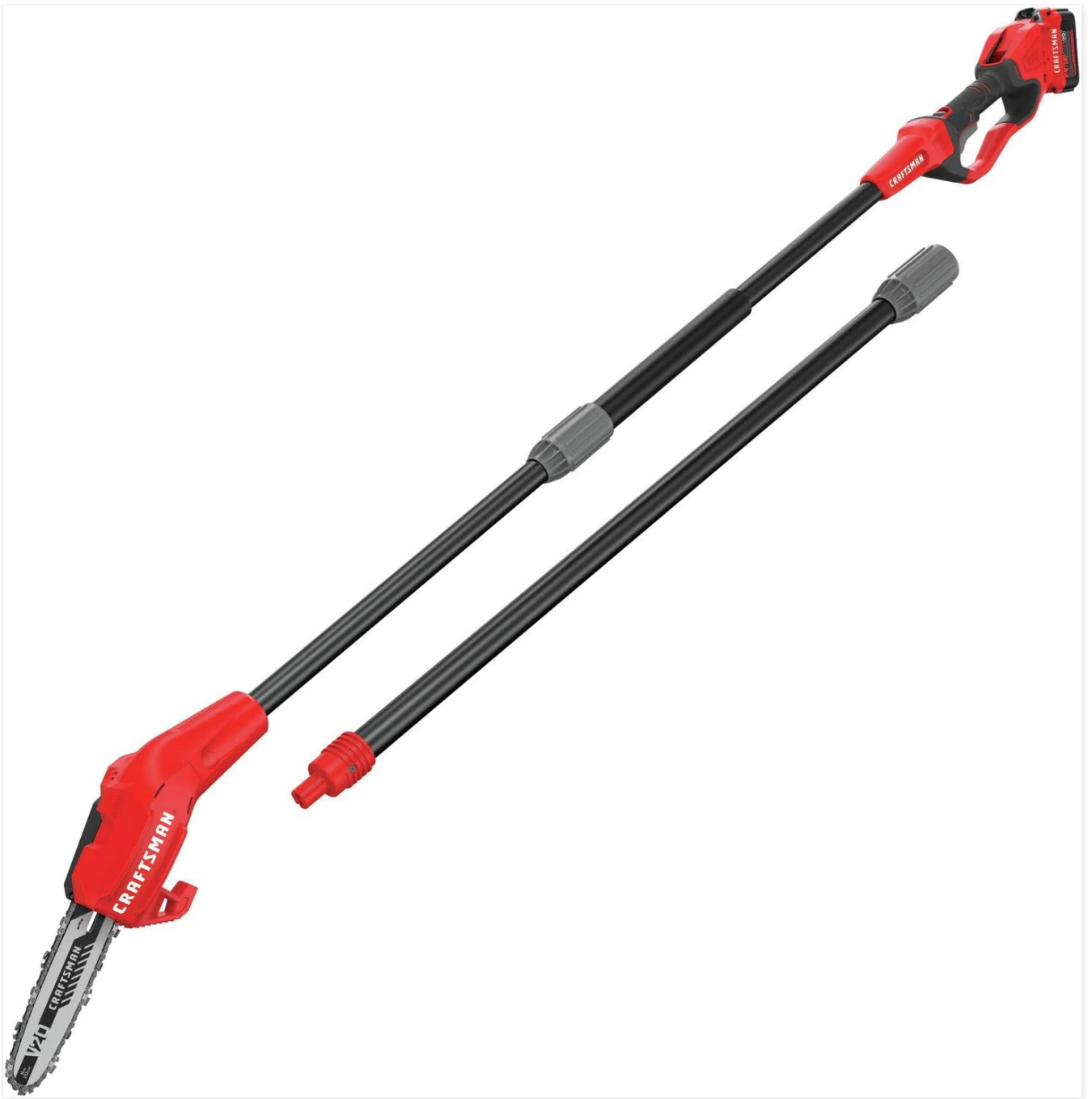
Figure 1: Fully assembled CRAFTSMAN V20 Cordless Pole Saw, ready for use.