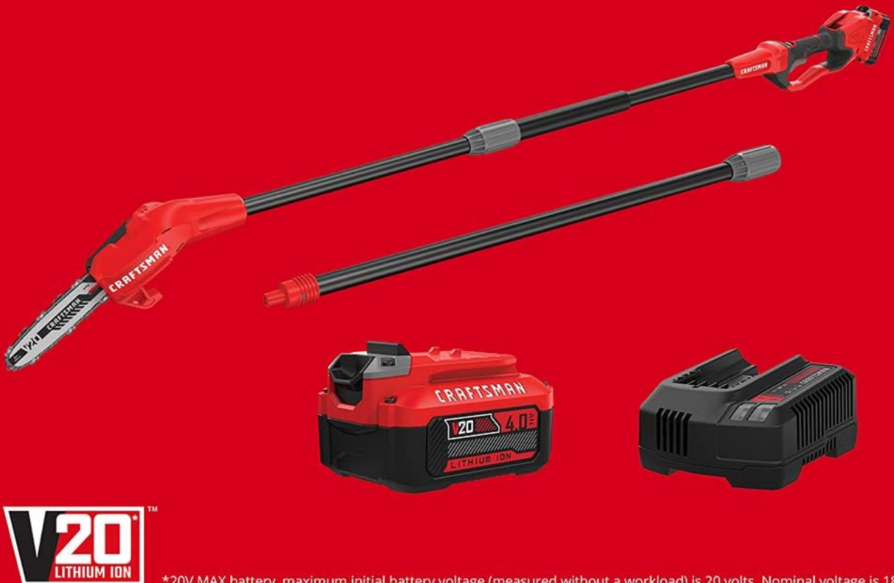
Figure 3: All items included in the product package: pole chainsaw head, extension pole, 4.0Ah battery, and charger.