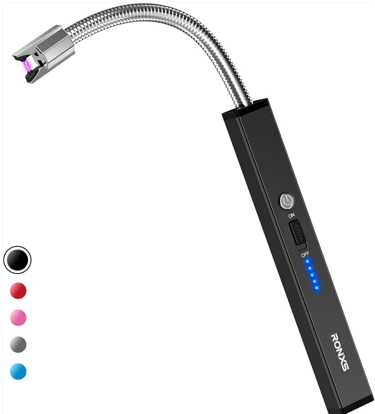
Figure 1: Ronxs Electric USB Rechargeable Candle Lighter. This image displays the main product, a black electric lighter with a flexible silver neck and LED battery indicator lights.