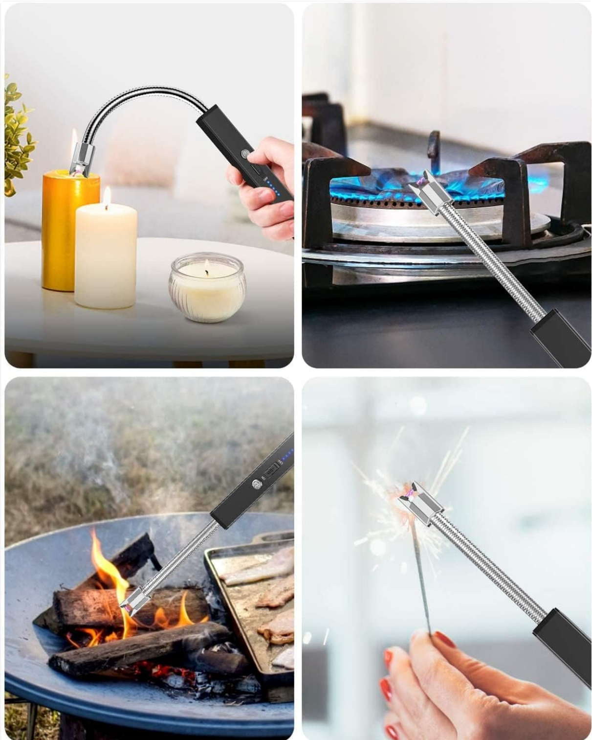
Figure 5: Various applications of the Ronxs Electric Lighter. This image demonstrates the lighter being used to ignite candles, a gas stove, a campfire, and sparklers, showcasing its versatility.

The flexible neck allows you to reach deep into candle jars or awkward spaces. The windproof design ensures consistent performance outdoors.