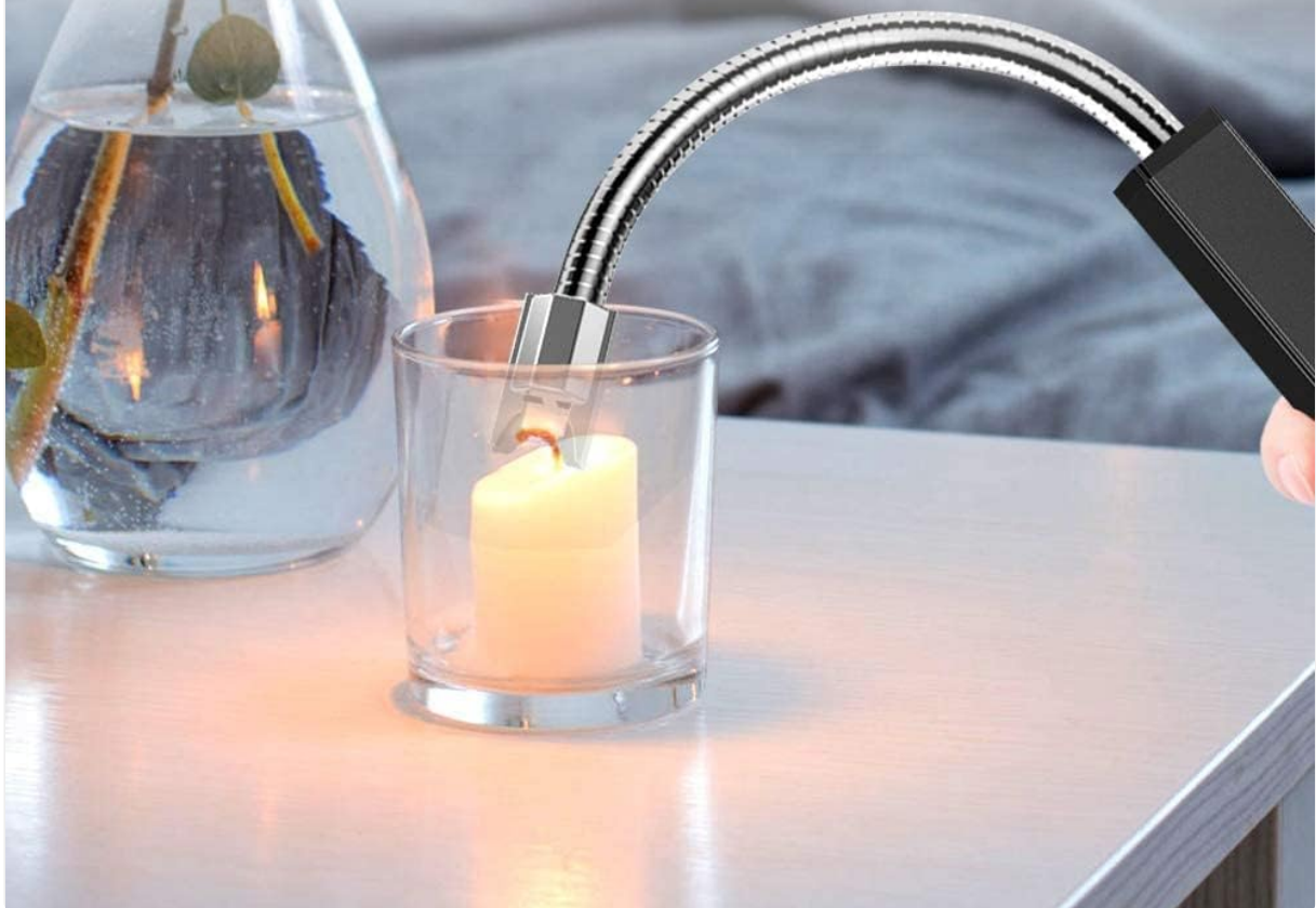
Figure 2: Key features of the Ronxs Electric Lighter. This image highlights that the lighter produces no flame or fire, no spark or smell, and operates with low noise, demonstrating its modern design.