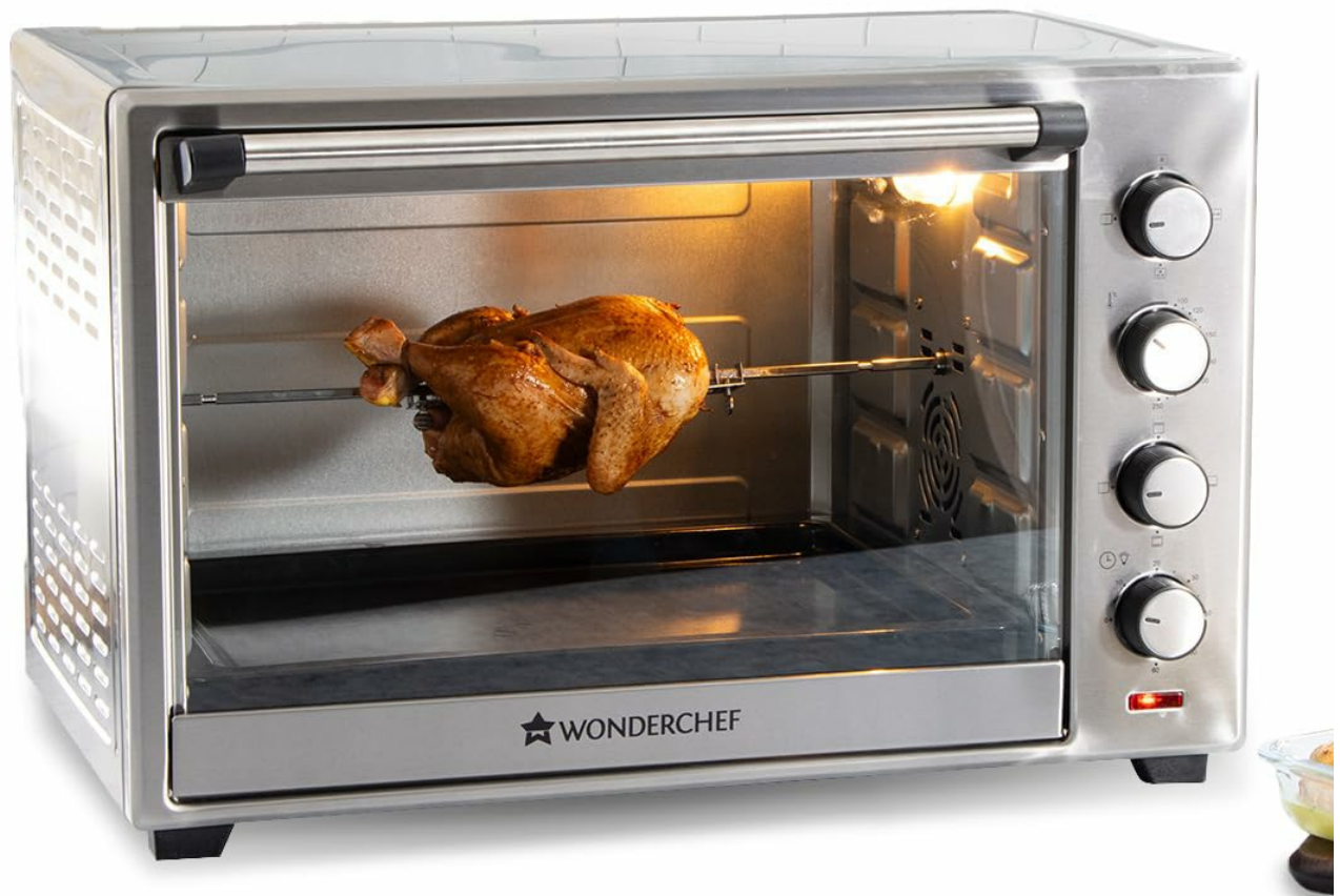
Image: The Wonderchef 60 Litre OTG, showcasing its spacious interior with a chicken roasting on the rotisserie, highlighting its primary function.