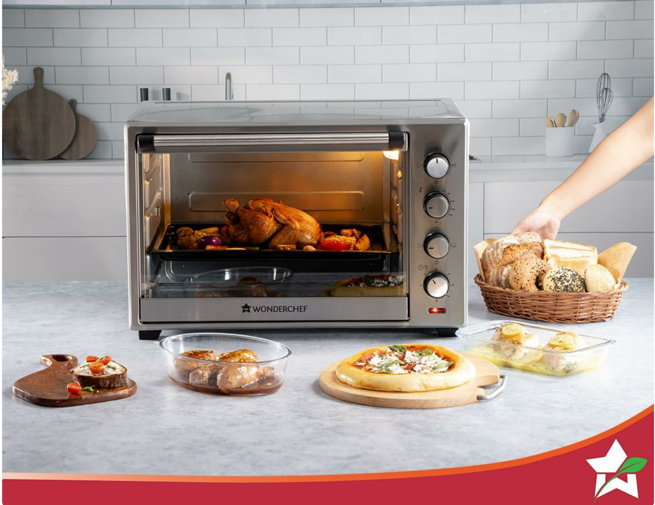
Image: The Wonderchef OTG displayed with its accessories including the wire rack, baking tray, and rotisserie, alongside various prepared dishes like toast, pizza, and roasted chicken, demonstrating its versatility.