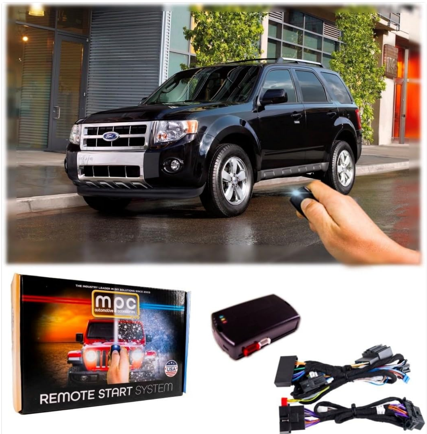
Figure 1: MPC Remote Start Kit components and a Ford Escape demonstrating remote start functionality.