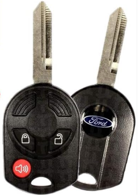
Figure 6: Utilize your existing factory key fobs to activate the remote start system.

Warm or Cool your vehicle without honking the horn while using your factory remotes.