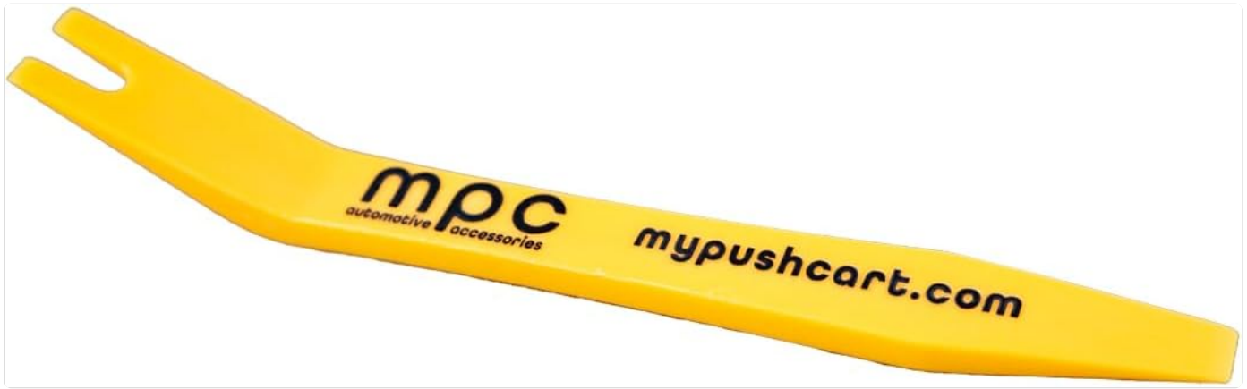
Figure 4: The installation process is designed for ease of use.