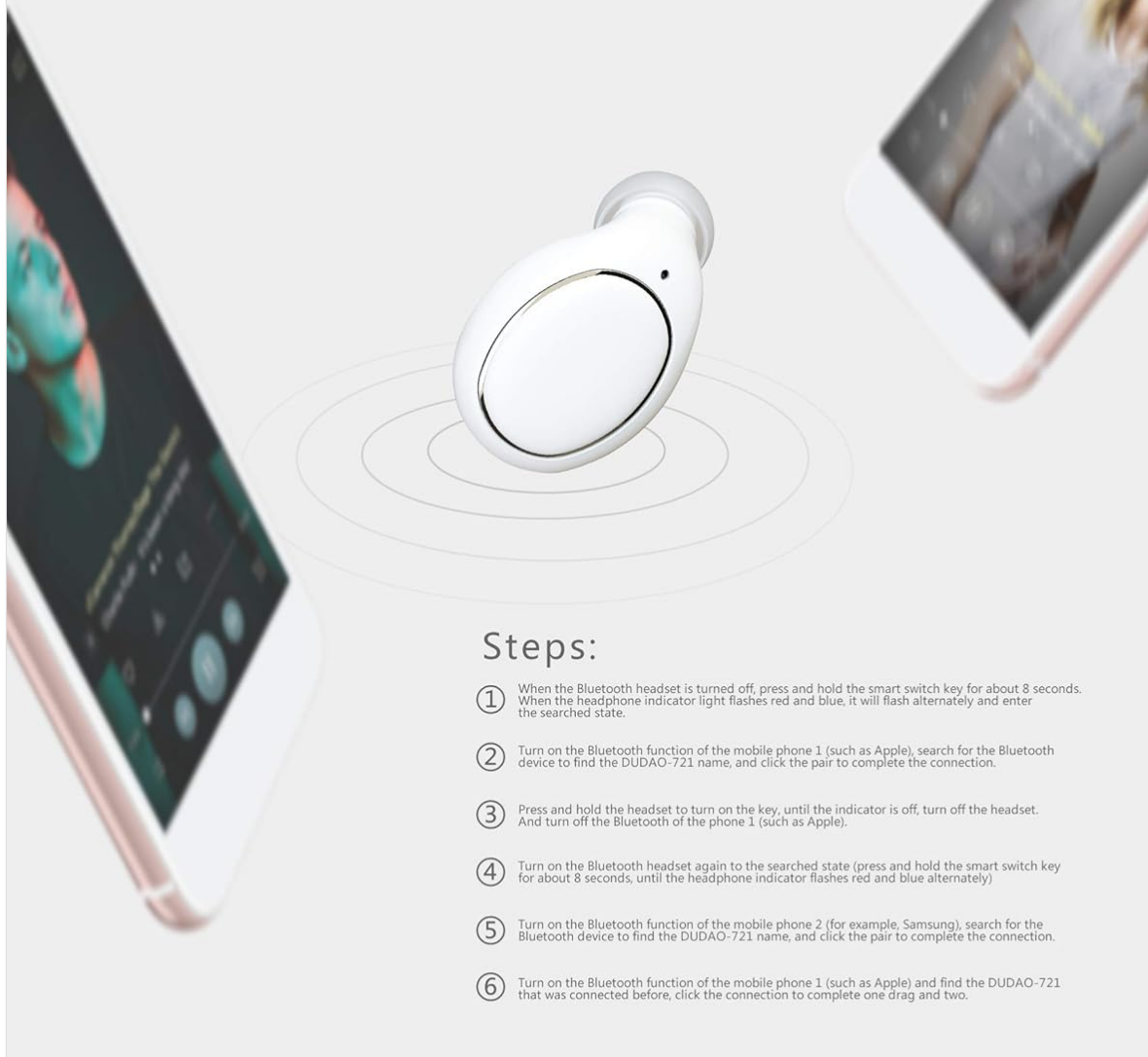
Image: Detailed steps for pairing the DUDAO DT-721 earphone with one or two Bluetooth devices simultaneously.

Support for simultaneous pairing of Bluetooth connected to two devices