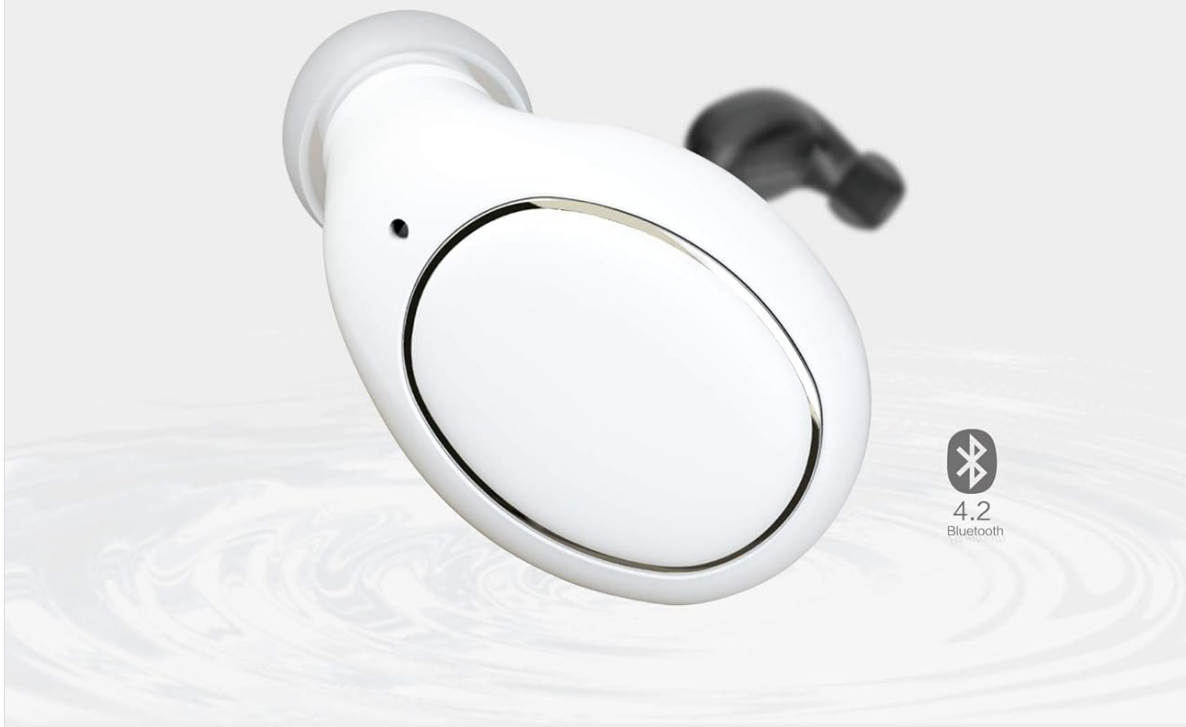
Image: The DUDAO DT-721 Mini Bluetooth Headset, showcasing its compact design and Bluetooth 4.2 technology.

Light and small business tool every chat is a pleasure