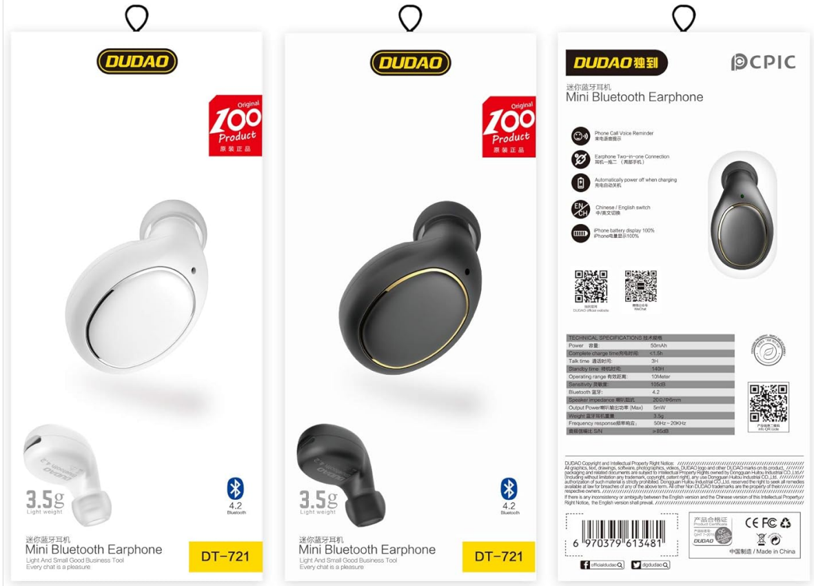
Image: Packaging and detailed specifications for the DUDAO DT-721 Mini Bluetooth Earphone, including model number and features.