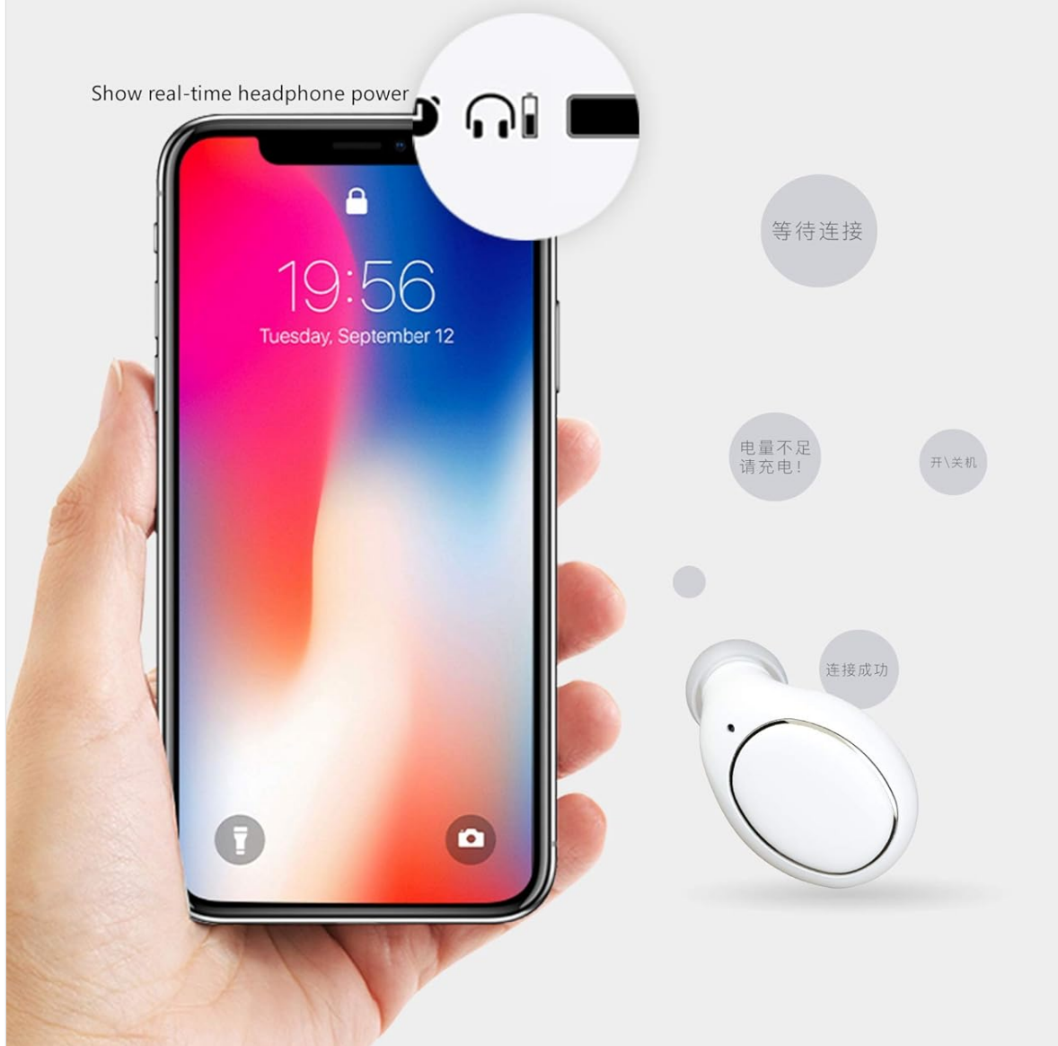
Image: An illustration of the DUDAO earphone's smart voice prompt feature, including real-time battery display on an iPhone and various status notifications.

Chinese English bilingual free switching, let you operate easily!