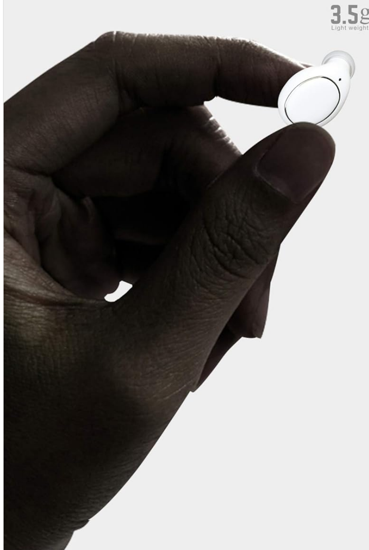
Image: The DUDAO Mini Bluetooth Earphone, demonstrating its extremely small and lightweight design (3.5g) when held in a hand.

Small to invisible so small that wearing it is completely unaware of its existence, light and comfortable