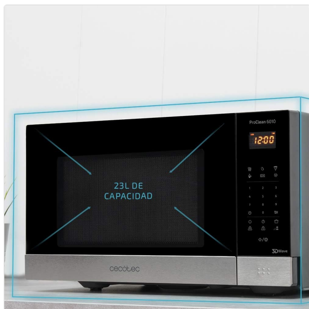
Illustration highlighting the 23-liter capacity of the microwave