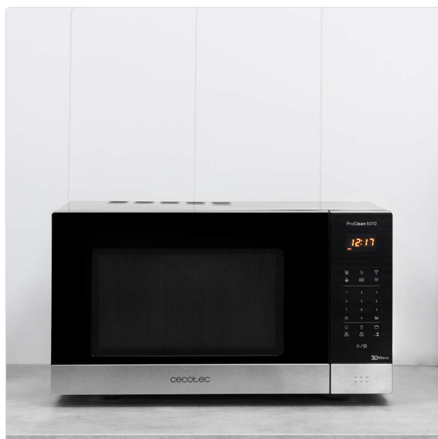
Front view of the Cecotec ProClean 6010 Microwave Oven, showcasing its sleek black and stainless steel design with digital display.