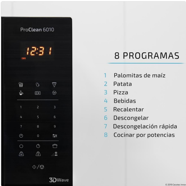
Close-up of the digital control panel, detailing the 8 preset programs available for different food types.