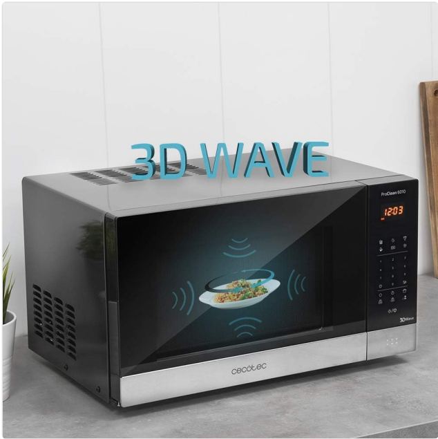
Visual representation of the 3DWave technology, showing how microwaves evenly distribute heat around food for consistent cooking.

oven, indicating ample space for various dishes.