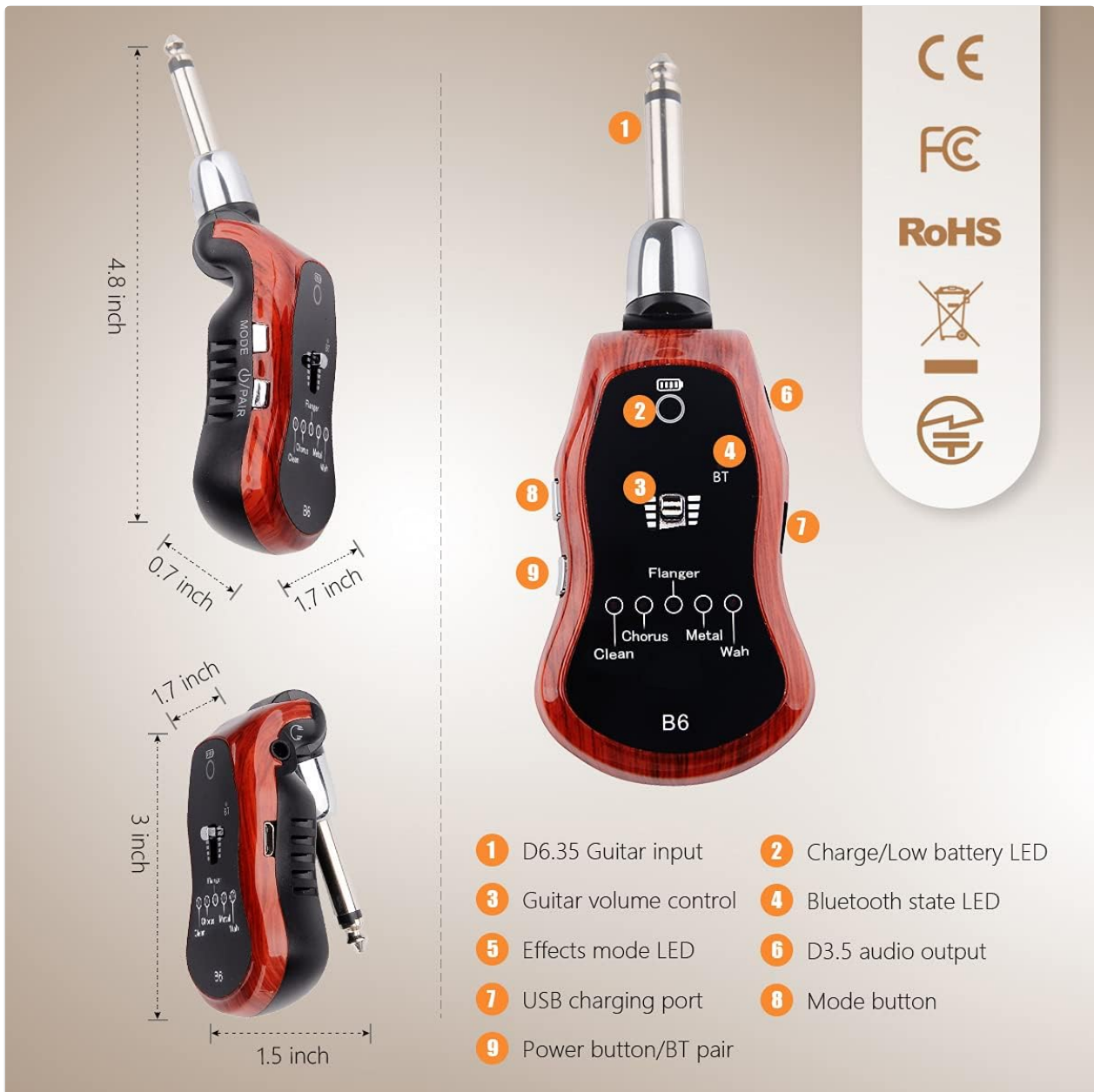
Figure 3: B6 Product Layout with Labeled Parts