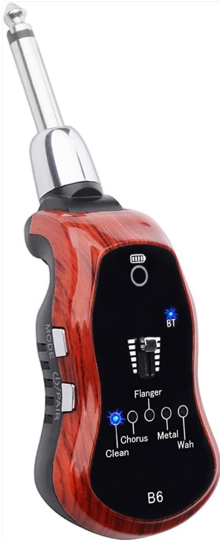
Figure 1: Kithouse B6 Guitar Headphone Amp