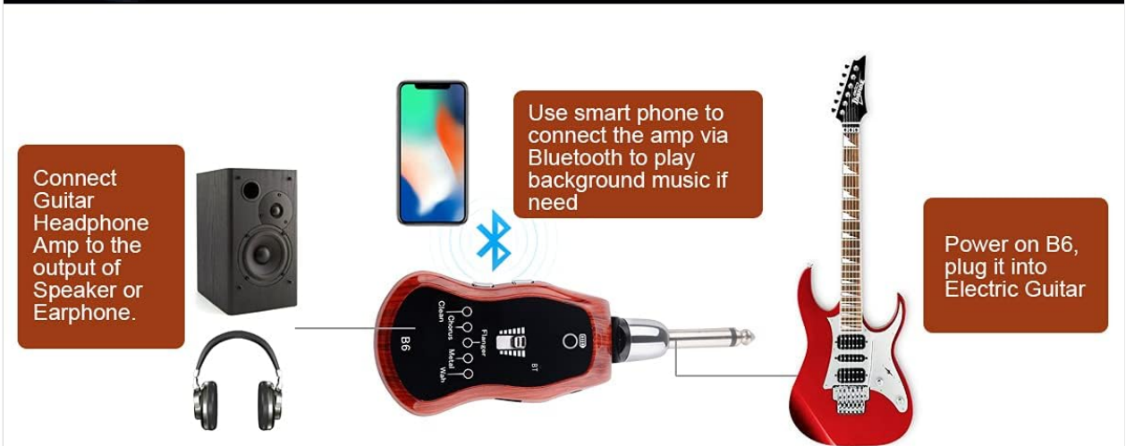
Figure 4: Connection Diagram for Guitar, Headphones/Speaker, and Bluetooth Device