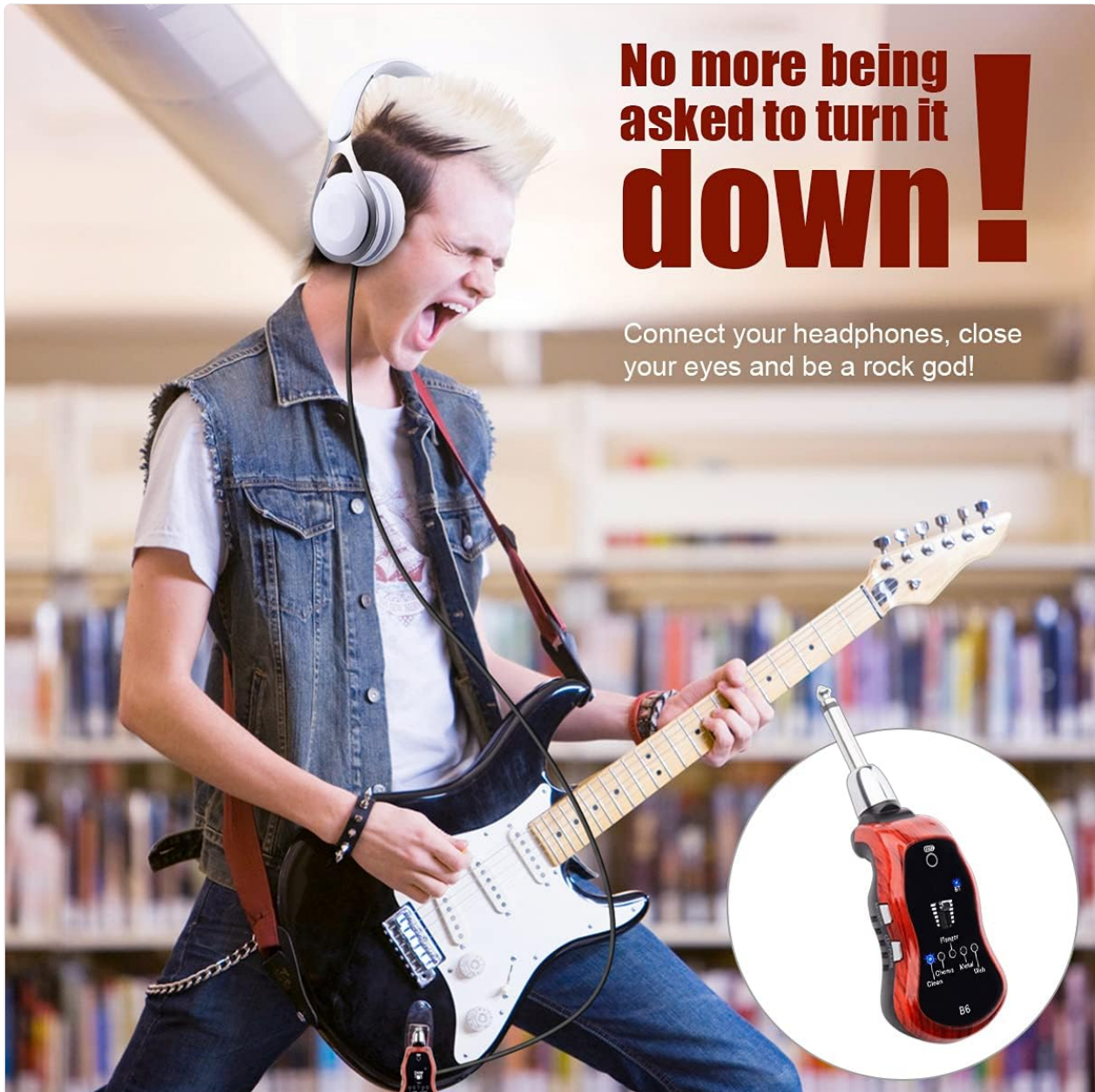
Figure 6: Enjoying silent practice with the B6

Use the Guitar Volume Control (3) to adjust the output volume of your guitar. If you are using the Bluetooth function, ensure the volume on your connected smartphone or tablet is also adjusted to achieve the desired mix with your guitar sound.