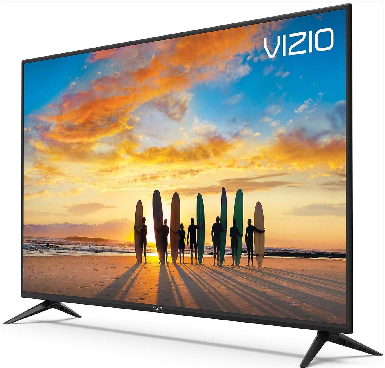
Figure 1: Front view of the VIZIO V-Series 50-inch 4K HDR Smart TV.