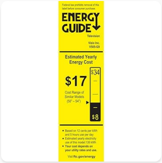
Figure 6: Energy Guide label for the VIZIO V505-G9 TV, showing estimated yearly energy cost.