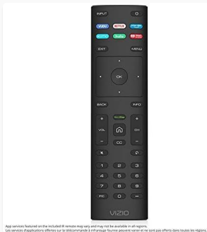
Figure 4: The VIZIO Smart TV remote control with quick access buttons for streaming services.

The included remote control provides access to all TV functions. It features dedicated buttons for popular streaming apps and navigation controls.