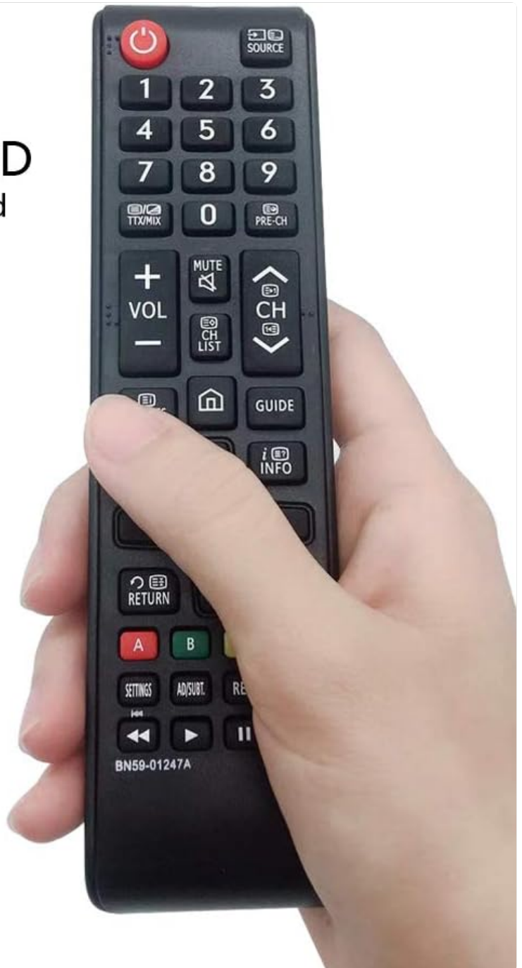
Image: A hand holding the remote control, with an inset showing the open battery compartment. Text overlay emphasizes "NO SETUP REQUIRED".