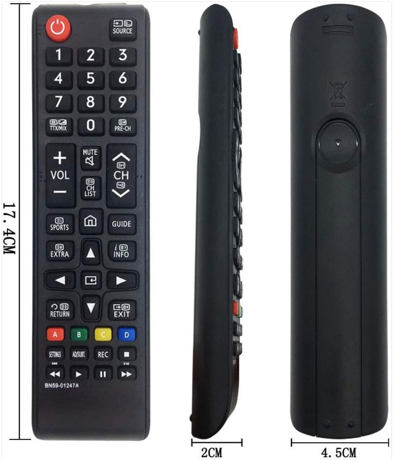
Image: Side and front views of the remote control with dimensions (17.4cm length, 2cm thickness, 4.5cm width) indicated.