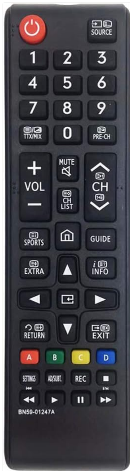
Image: Front view of the MYHGRC replacement remote control, showing all buttons and its ergonomic design.