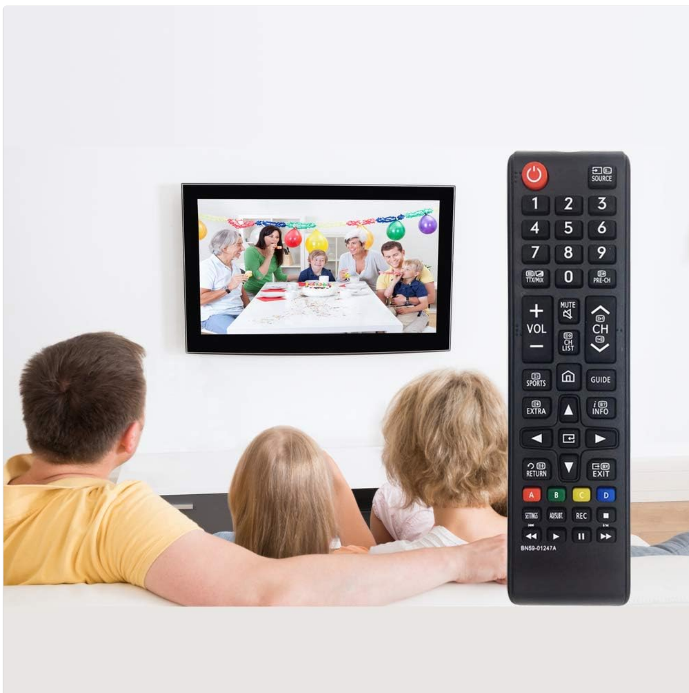
Image: A family watching television, with the MYHGRC remote control prominently displayed in the foreground, illustrating typical usage.