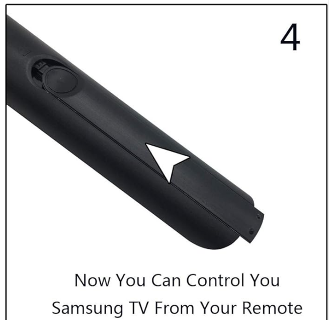
Image: A four-panel diagram illustrating the steps for battery installation: 1. Removing the battery cover, 2. Distinguishing positive and negative electrodes, 3. Inserting batteries, and 4. Closing the cover.