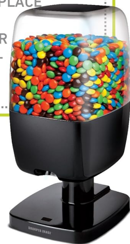
Figure 1: Filling the dispenser with treats.