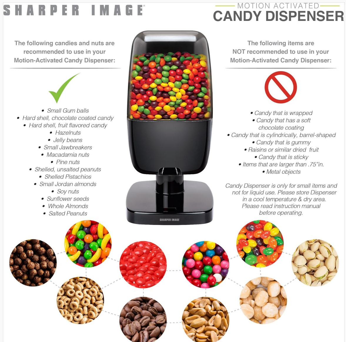
Figure 3: Guide for suitable and unsuitable items.