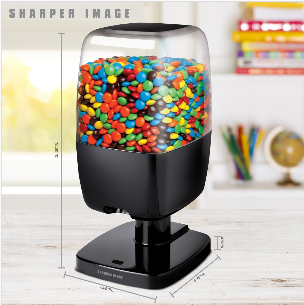
Figure 4: Product dimensions.