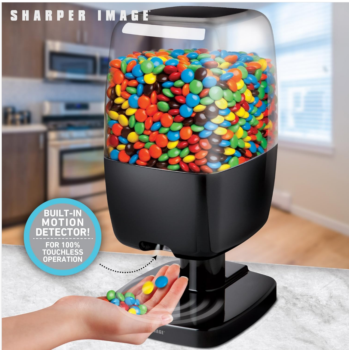
Figure 2: Hands-free dispensing in action.