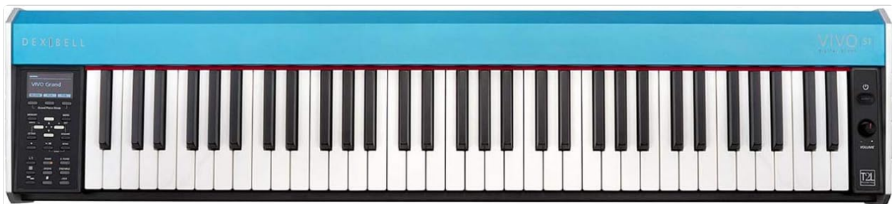
Figure 1.1: Top view of the Dexibell VIVO S1 Digital Stage Piano, illustrating the 68-key keyboard layout and control panel.

The Dexibell VIVO S1 is a portable 68-key digital stage piano designed for musicians seeking high-quality sound and performance in a compact form factor.