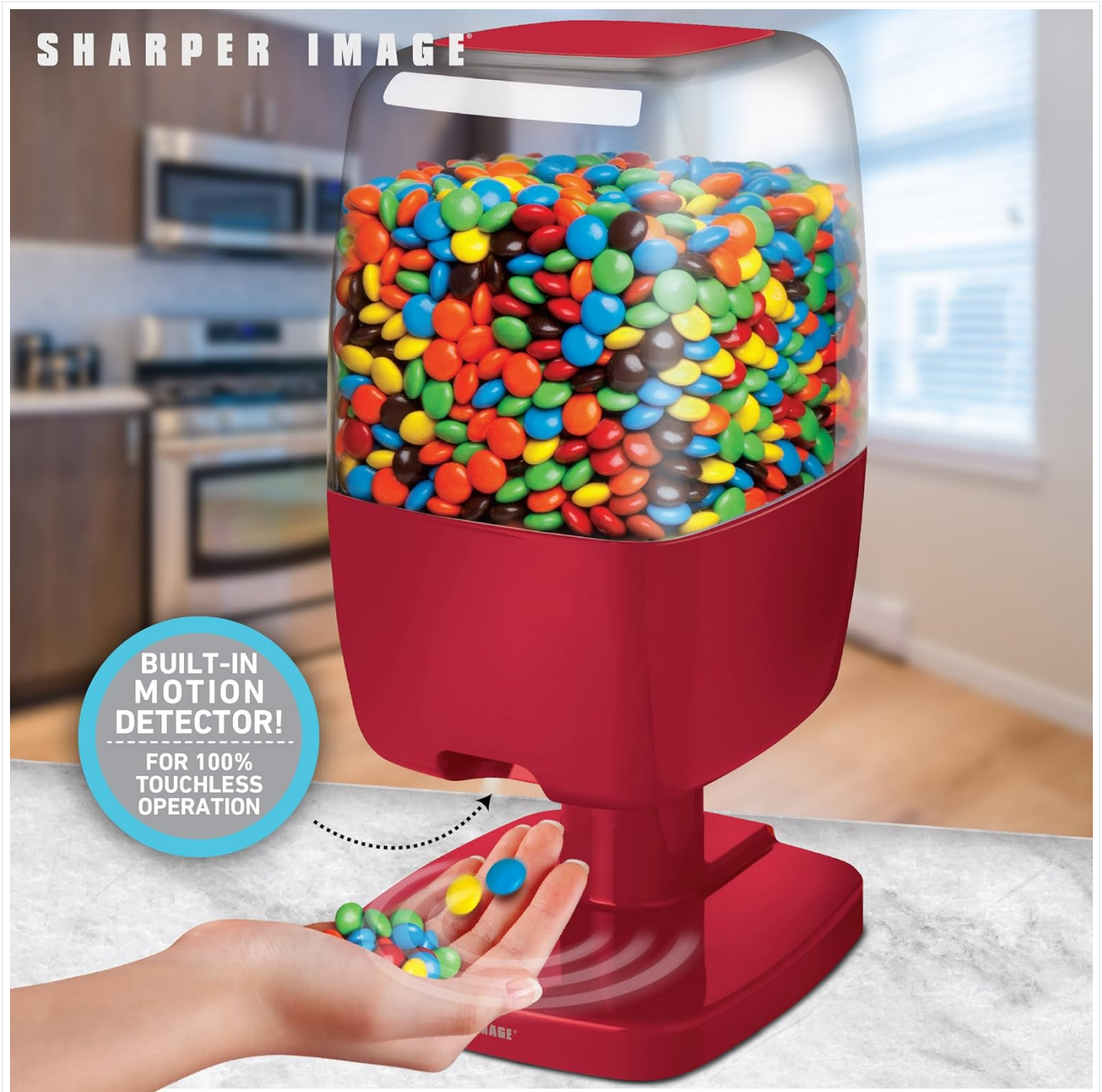
Image: A hand placed under the chute of the Sharper Image Motion Activated Candy Dispenser, illustrating the touchless motion detection feature for dispensing candies.