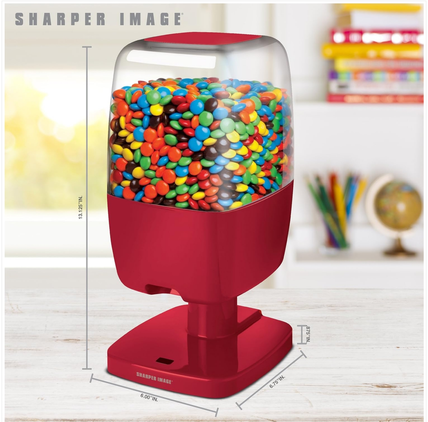
Image: A diagram showing the approximate dimensions of the Sharper Image Motion Activated Candy Dispenser: 13.125 inches in height, 6.00 inches in width, and 6.75 inches in depth.