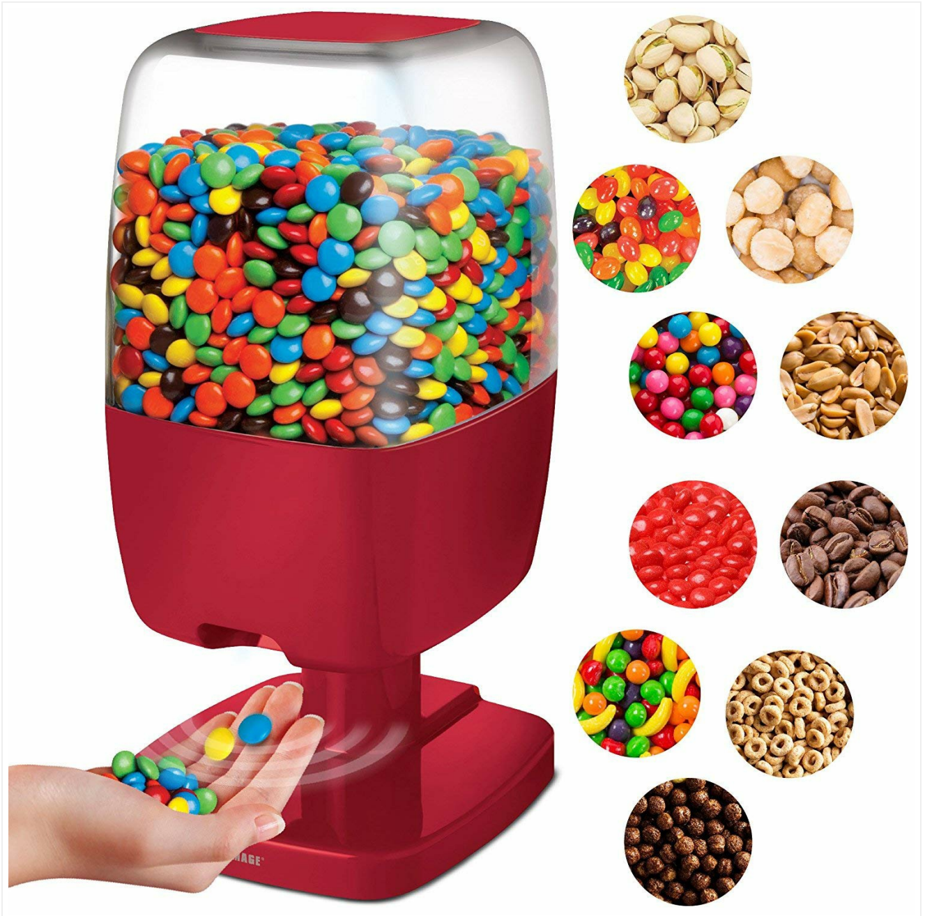
Image: A visual guide illustrating various types of candies and nuts, categorizing them as recommended or not recommended for use with the Sharper Image Motion Activated Candy Dispenser. Examples of recommended items include M&Ms, jelly beans, and peanuts, while wrapped candies and gummy items are not recommended.