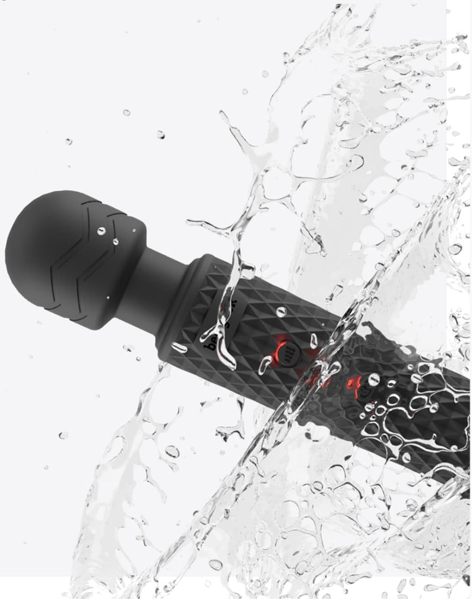
Image: The bed geek massager shown with its USB charging cable, emphasizing its travel-friendly and fast-chargeable design.

Your browser does not support the video tag.