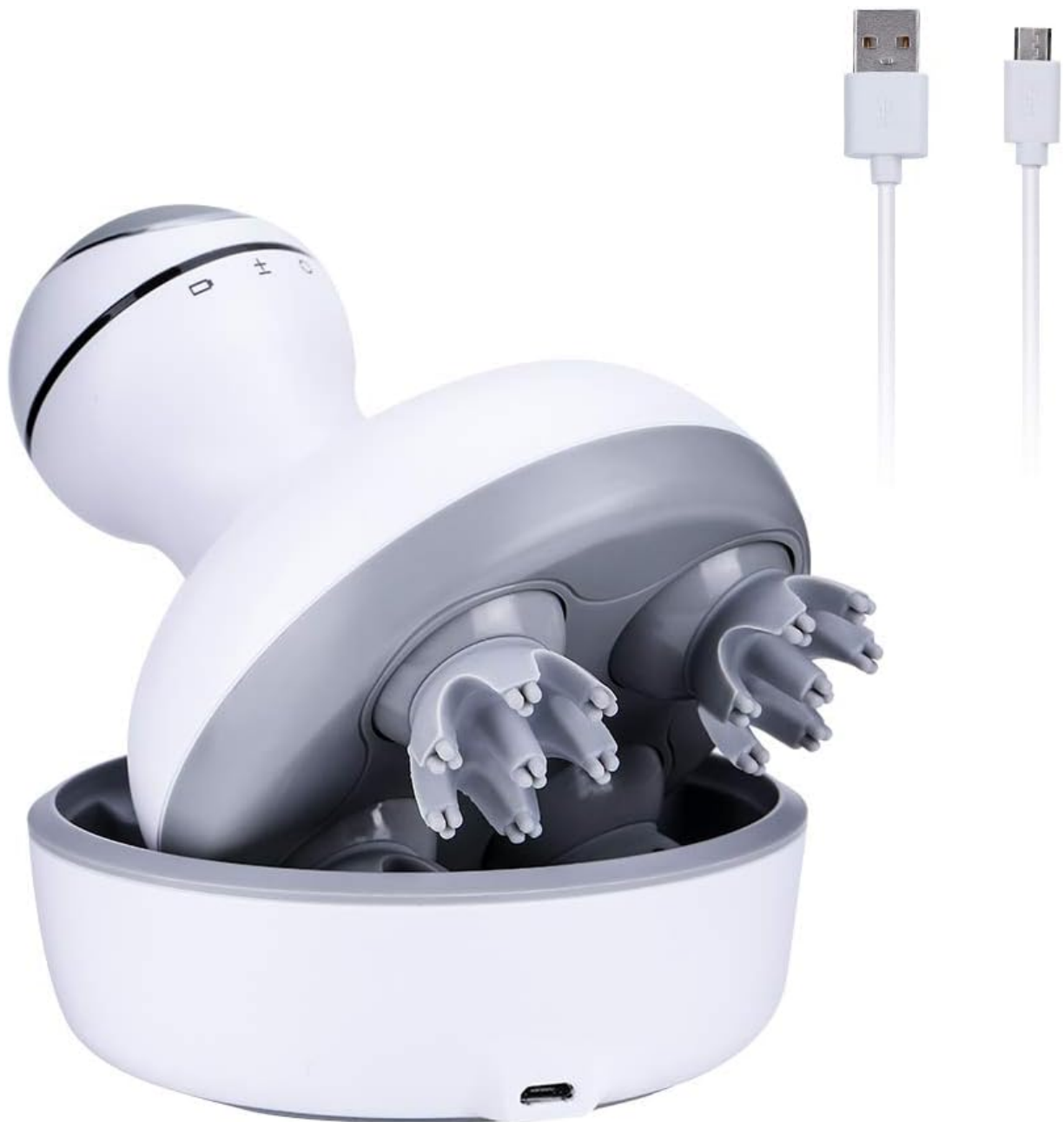
Figure 5: Massager unit, charging base, USB cable, and interchangeable massage heads.