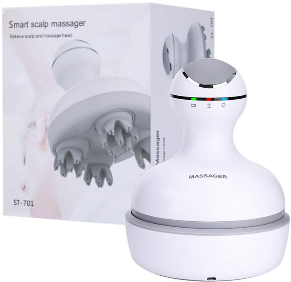
Figure 4: The Haofy massager and its packaging.