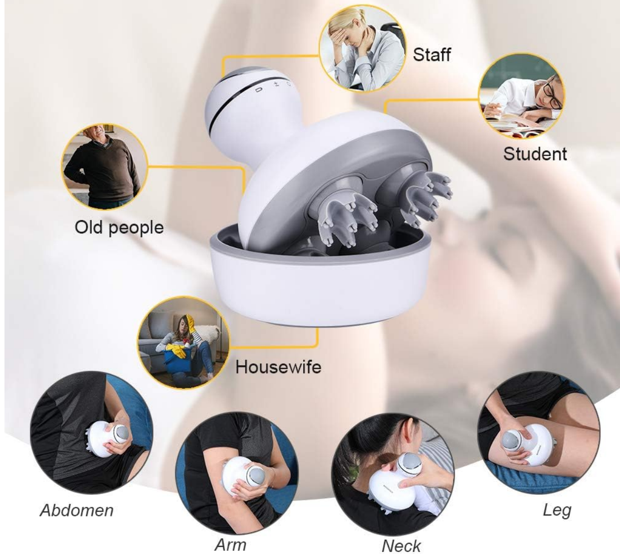
Figure 3: The massager's versatility for use on multiple body areas.