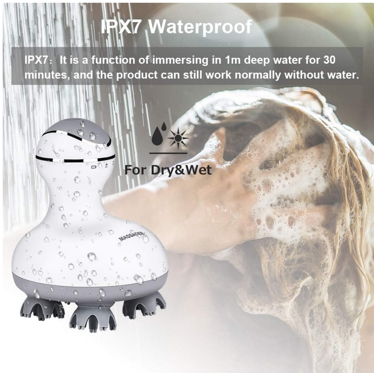
Figure 6: The massager is IPX7 waterproof, allowing for use in wet conditions.