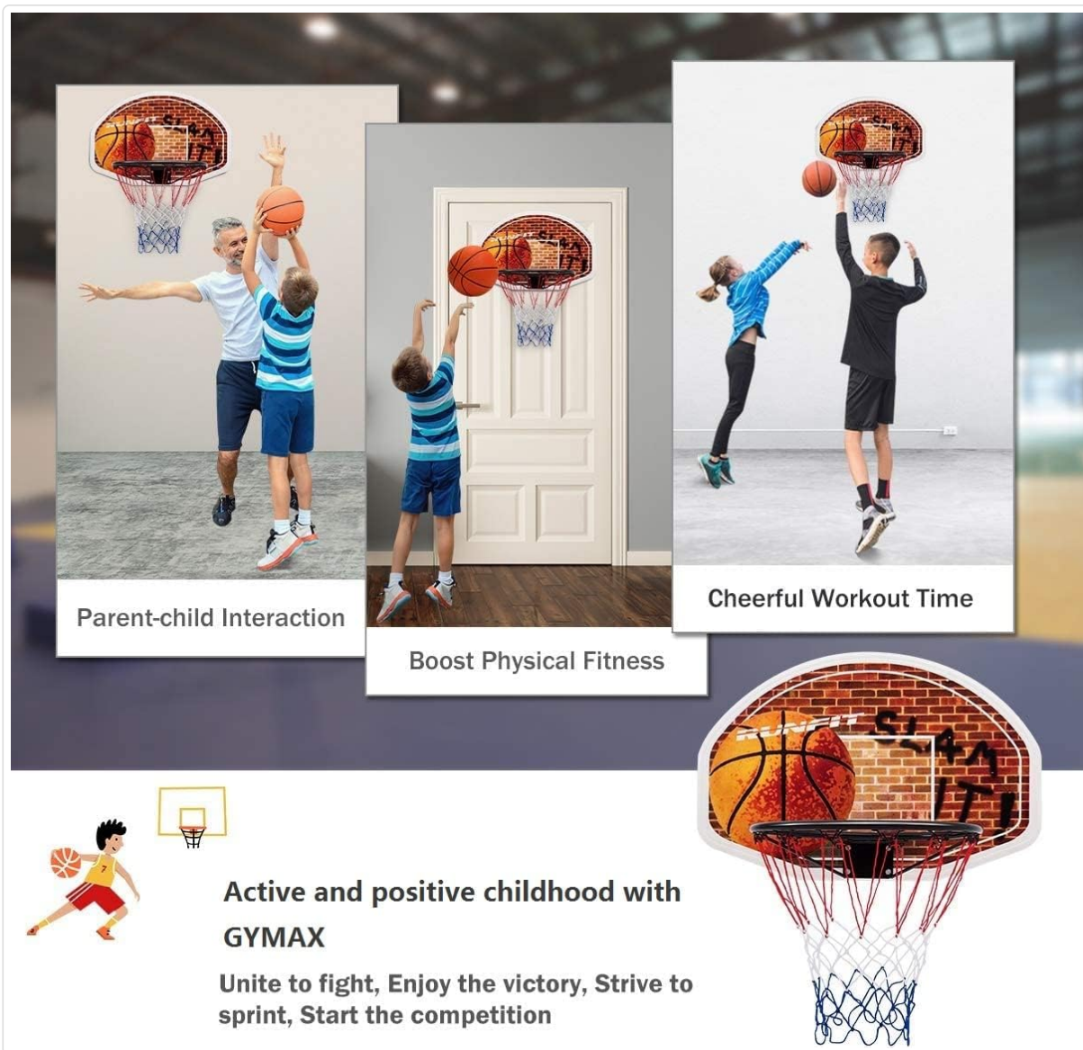
Image: Examples of the GYMAX Mini Basketball Hoop being used in various settings, including over a door and on a wall, highlighting its versatility for indoor and outdoor play.