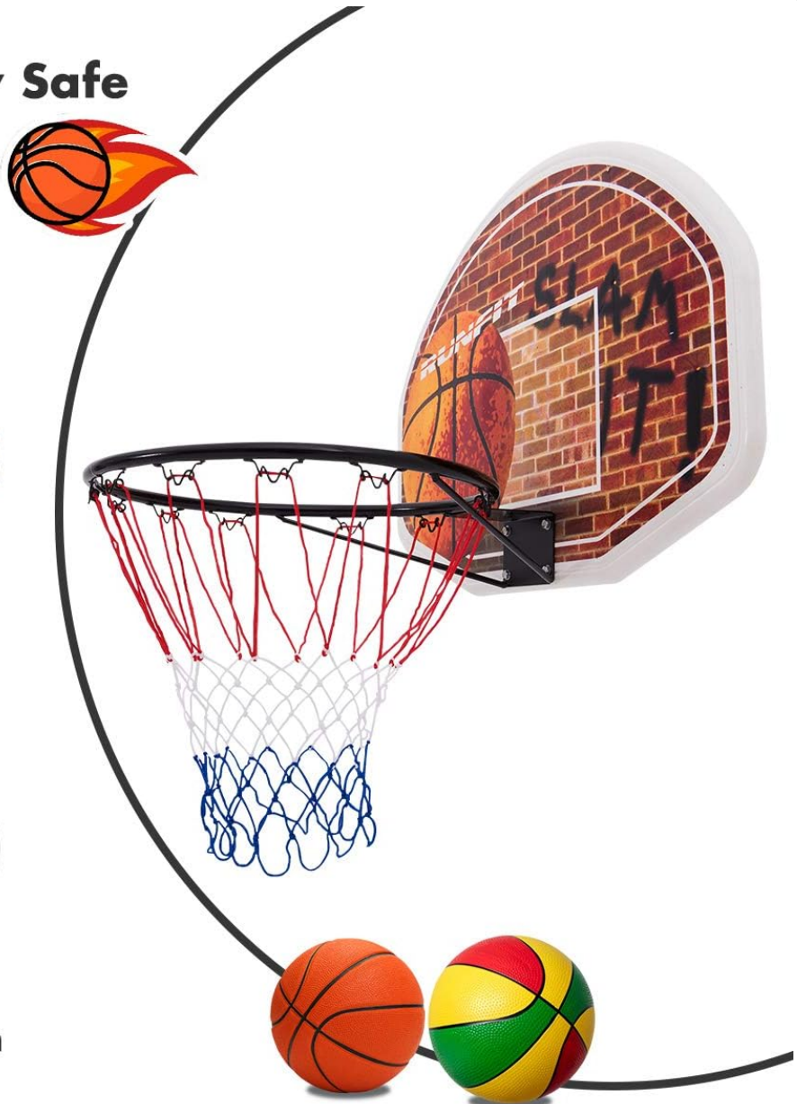
Image: All components of the GYMAX Mini Basketball Hoop, including the backboard, rim, and two nets.