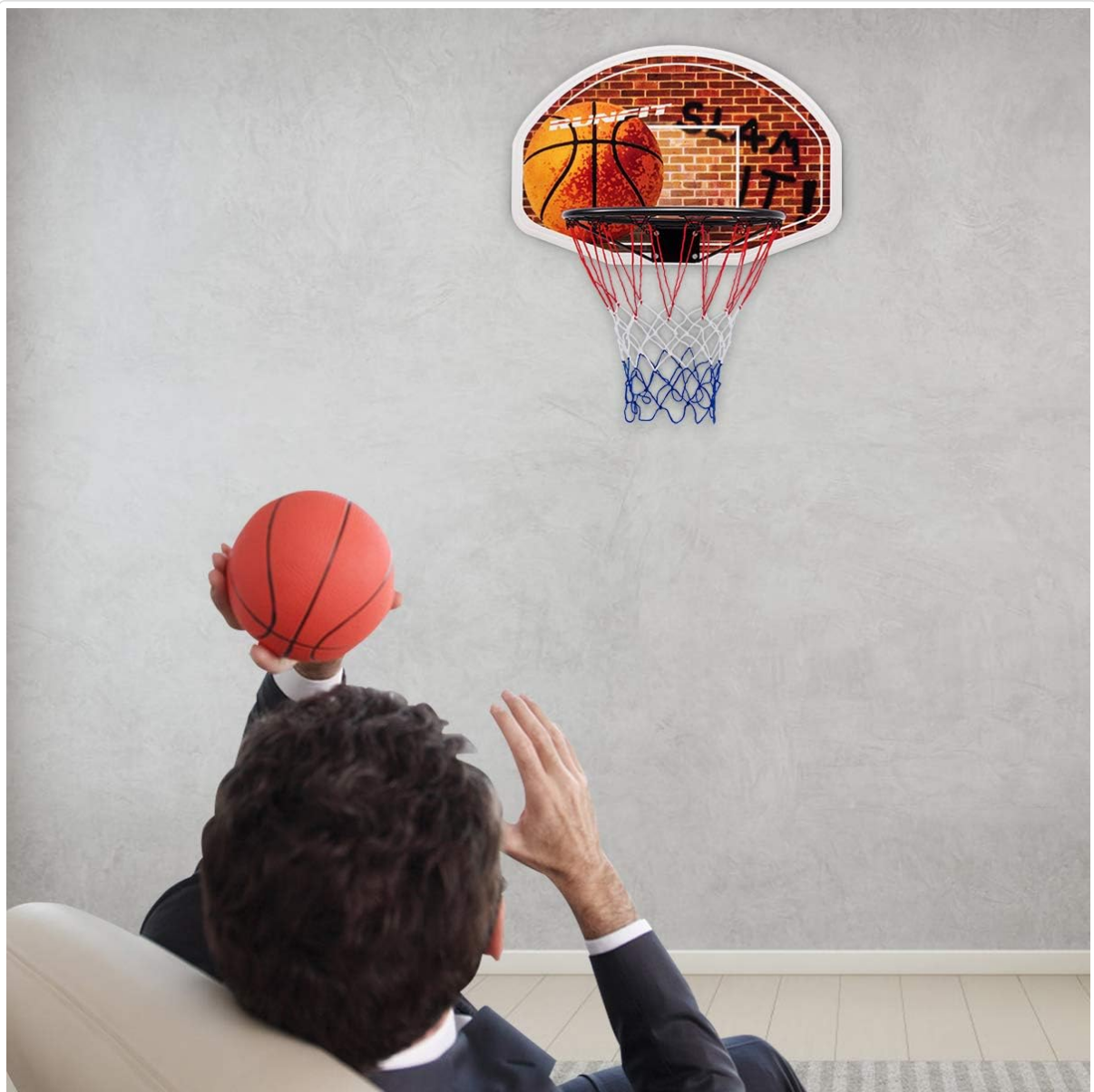
Image: An adult preparing to shoot a mini basketball into the wall-mounted hoop, demonstrating its appeal for all ages.