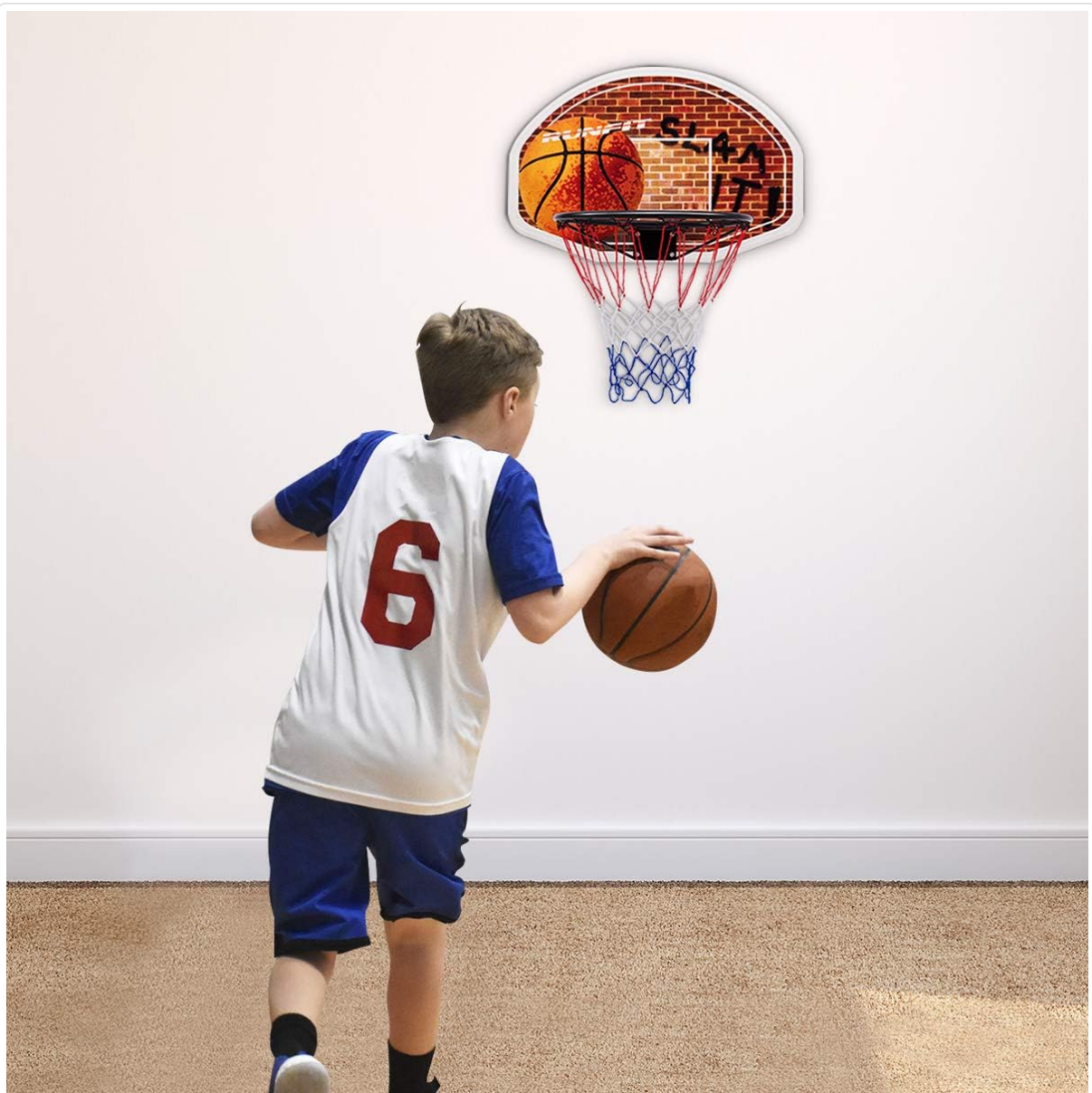
Image: A child dribbling a mini basketball before shooting at the wall-mounted hoop, illustrating its use for younger players.