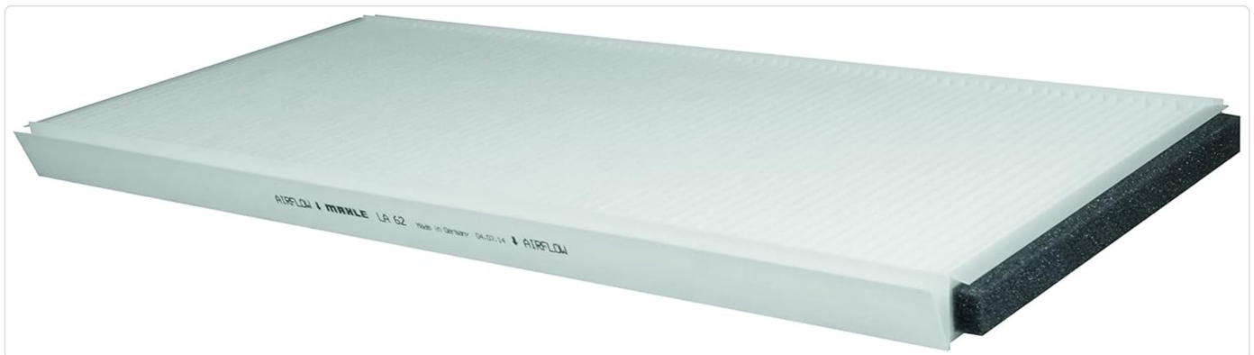
Figure 1: The MAHLE LA62 Interior Air Filter. This image shows the rectangular filter with its pleated media and foam sealing edge, ready for installation.

The MAHLE LA62 is a high-quality interior air filter designed to ensure clean and fresh air within your vehicle's cabin. This particle filter effectively removes dust, pollen, soot, and other airborne particulates, contributing to a healthier and more comfortable driving environment. Regular maintenance of your interior air filter is crucial for optimal performance of your vehicle's heating, ventilation, and air conditioning (HVAC) system.