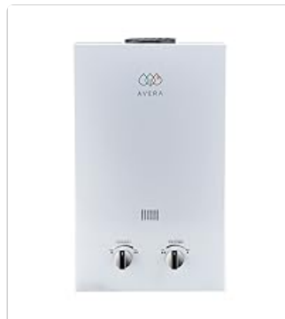
Image: Another visual representation of the AVERA C6L highlighting its specifications and benefits.

Image: Summary of key features including 1 service, 6 L/min heating, automatic ignition, temperature protection, 80% gas saving, and 2-year warranty.