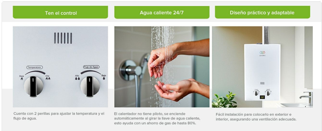
Image: Avera C6L water heater providing hot water, highlighting its instant heating capability as water flows from a showerhead.

Note: The digital thermometer (if present on your model) measures internal pipe temperature, which may not accurately reflect the actual water temperature at the tap. Always test the water temperature manually before use to prevent scalding.