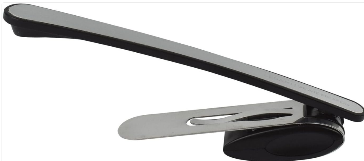
Figure 1: The Legami LED Reading Light in its folded, compact position, ready for storage or transport. The main body is black with a silver-colored metallic strip.

The Legami Adjustable LED Reading Light is a compact and portable illumination device designed for reading in various environments. Its adjustable design allows for flexible positioning, providing optimal light where you need it.