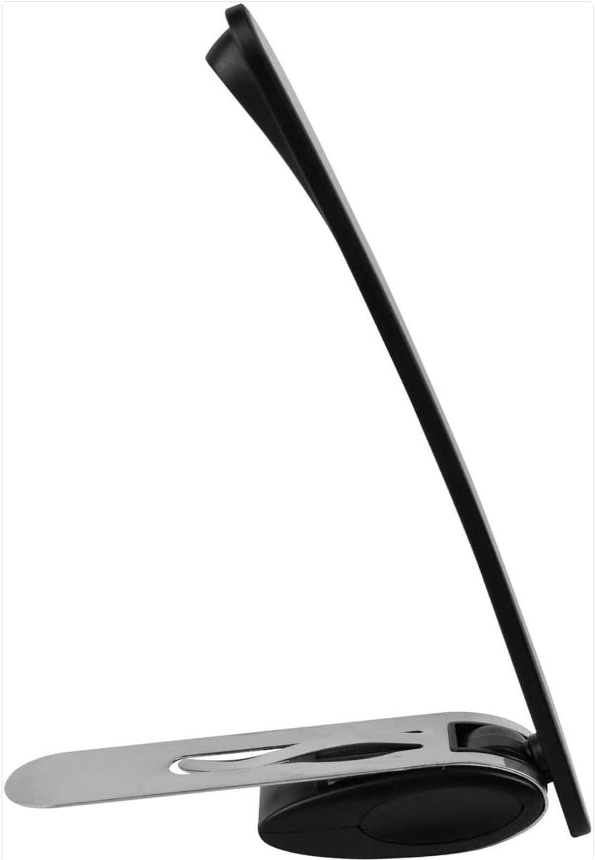
Figure 3: The reading light fully extended and ready for use. The adjustable arm and clip mechanism are visible, designed to attach to books or other surfaces.