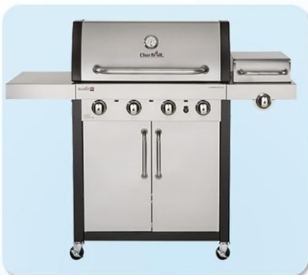
Charbroil Commercial TRU-Infrared 4-Burner

463242715 463242716 466242715 466242716 466242815 466242816 463257520