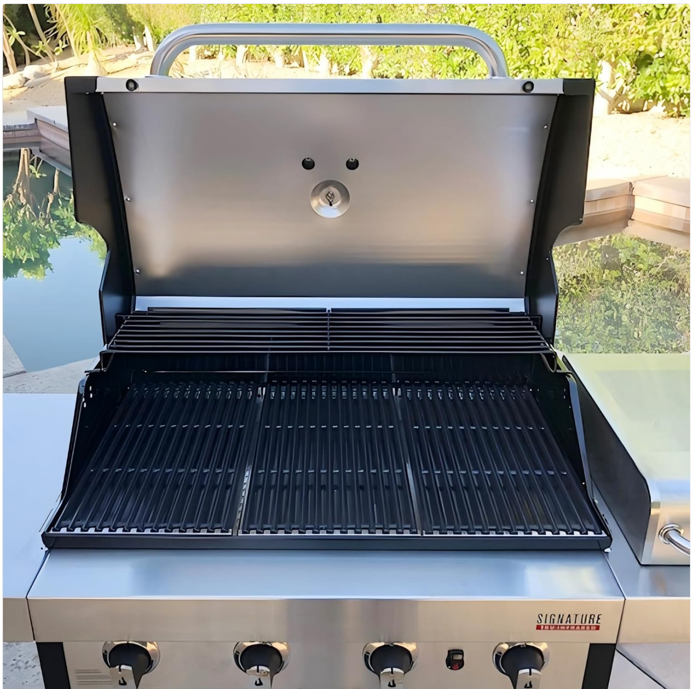
Image: A wide view of an open Charbroil grill, showcasing the newly installed grates and the complete cooking surface.