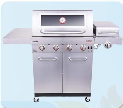
Charbroil Signature TRU-Infrared 4-Burner