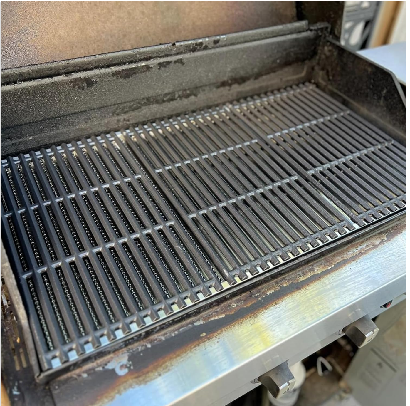
Image: The new grill grates properly installed within a Charbroil grill, ready for use.