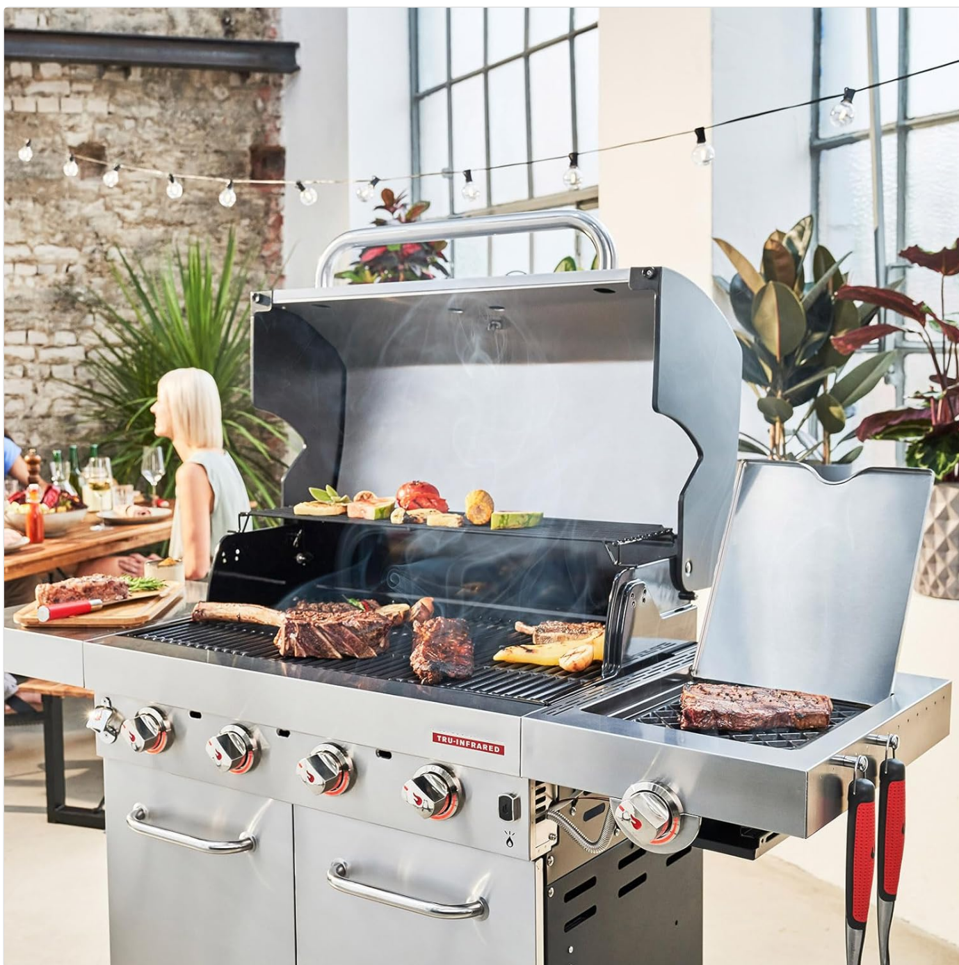
Image: Various foods being cooked on the grill grates, demonstrating the effective heat transfer and the creation of desirable grill marks.

Video: A brief demonstration of replacement parts for Charbroil TRU-Infrared Grills, including the grill grates. This short clip illustrates the compatibility and fit of the replacement components.