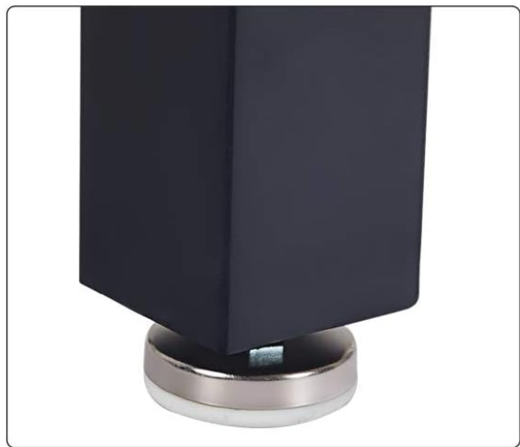
Plastic Adjust Feet