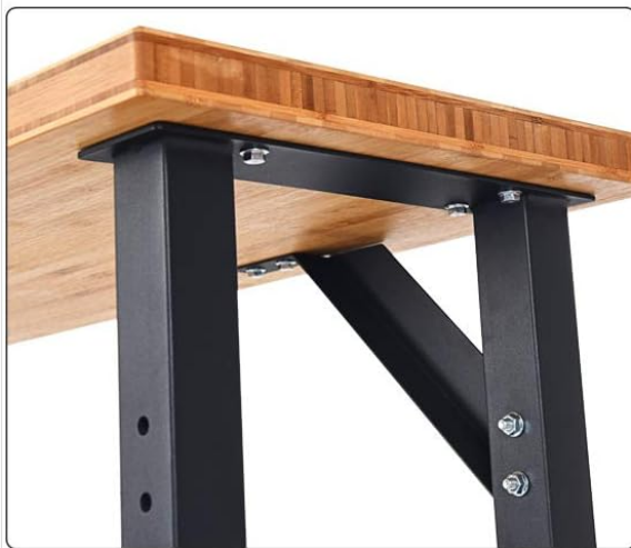
Triangular Reinforcement Design