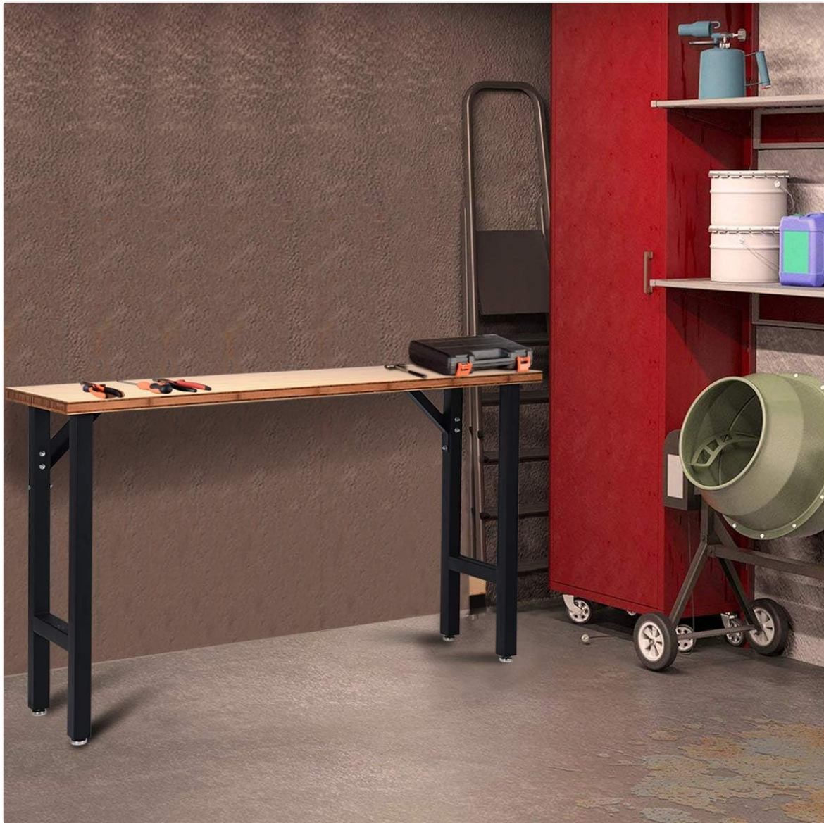
Figure 3: Workbench in a garage environment, demonstrating its practical application.

auto repair, hitting, staining, drilling, and cutting.