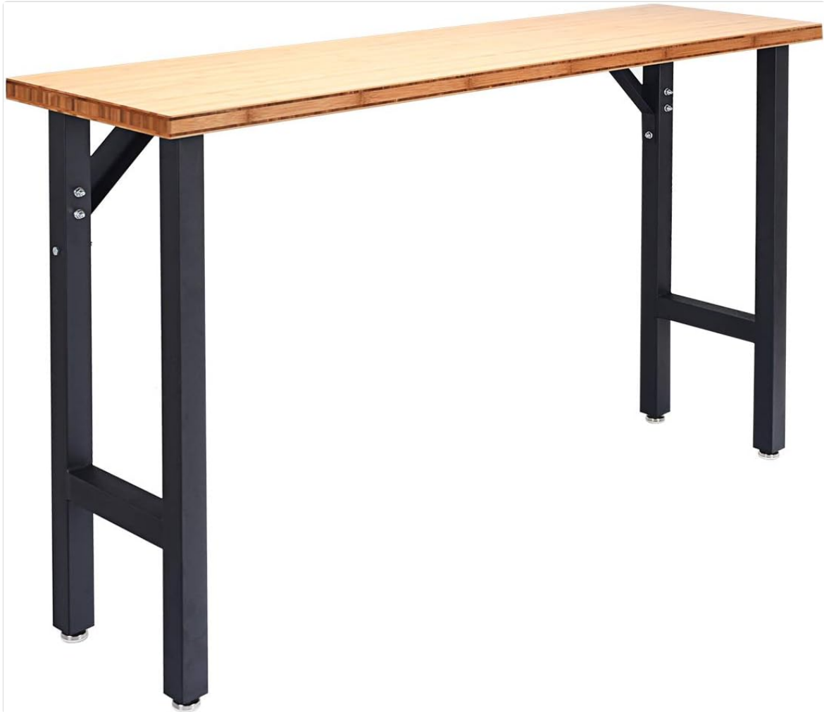
Figure 2: An assembled Goplus workbench, ready for use.