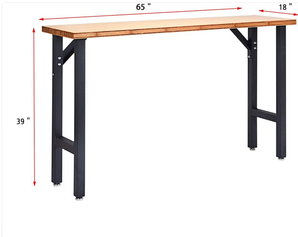
Figure 4: Workbench dimensions overview.