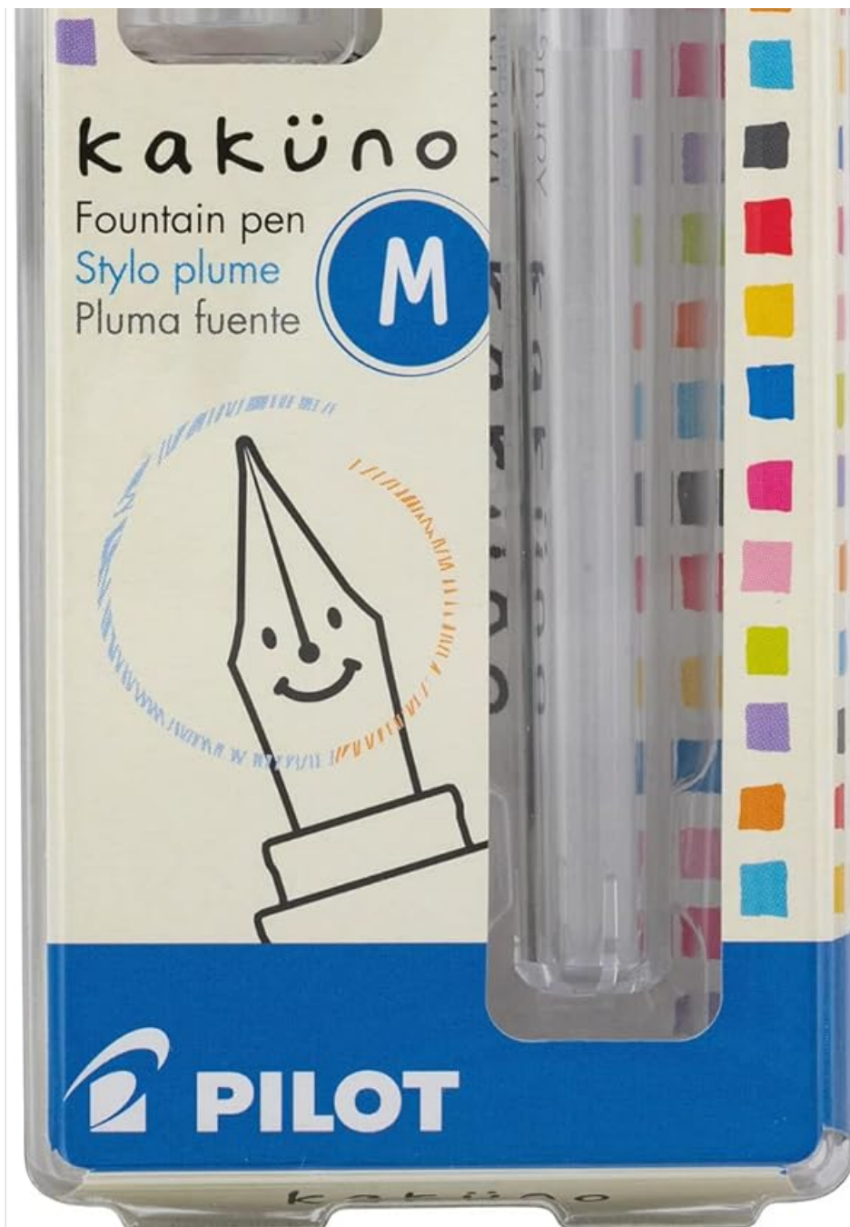
Figure 1.1: PILOT Kakuno Fountain Pen in its original packaging.