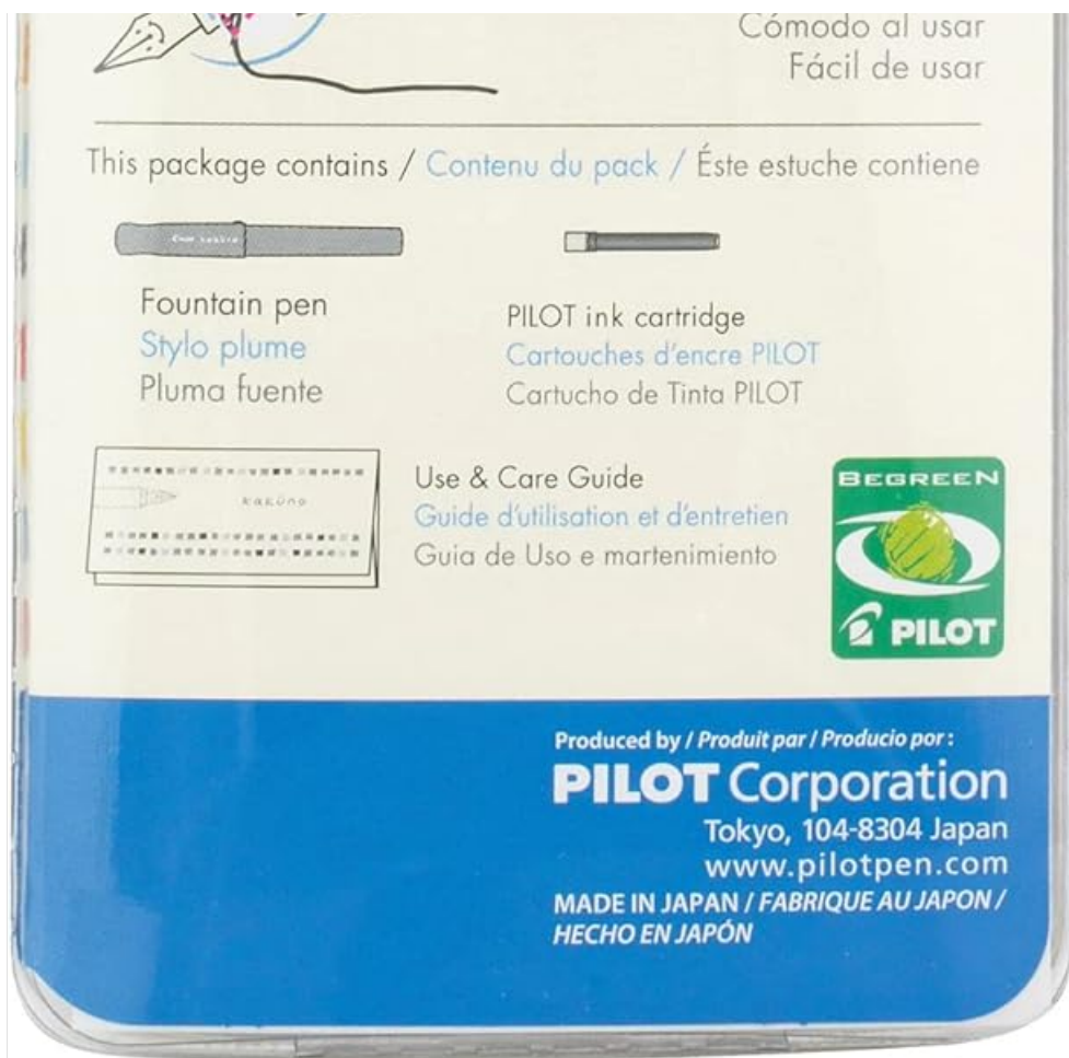
Figure 2.1: Back of the packaging, illustrating the included components and basic instructions.