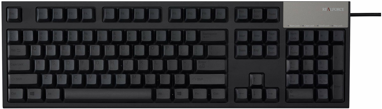
Image: The REALFORCE R2 Full-size Black Mixed Key Weight Keyboard, showing its complete layout and design.