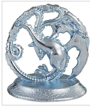
Figure 2.1: A silver-colored game token shaped like a dragon, representing one of the Great Houses.

Other tokens include a lion (House Lannister), a direwolf (House Stark), a stag (House Baratheon), a rose (House Tyrell), and a crown (representing the Iron Throne).